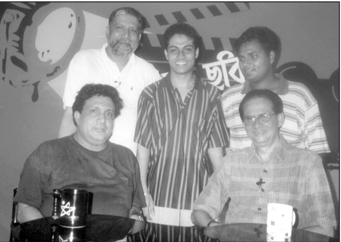
Participants in an episode of Amar Chabi

Television magazine creates unique record as it reaches the doorstep of its hundredth episode