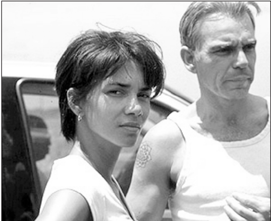
Halle Berry and Billy Bob Thornton in Lions Gate's Monster's Ball