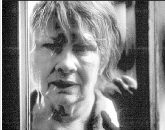
Judi Dench in Miramax's Iris