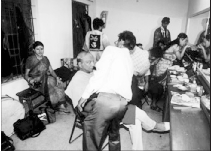
Ascene from Make-up room