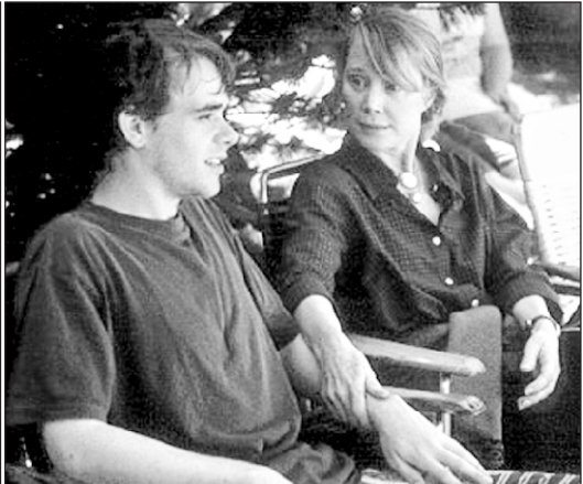
Nick Stahl and Sissy Spacek in Miramax's In The Bedroom