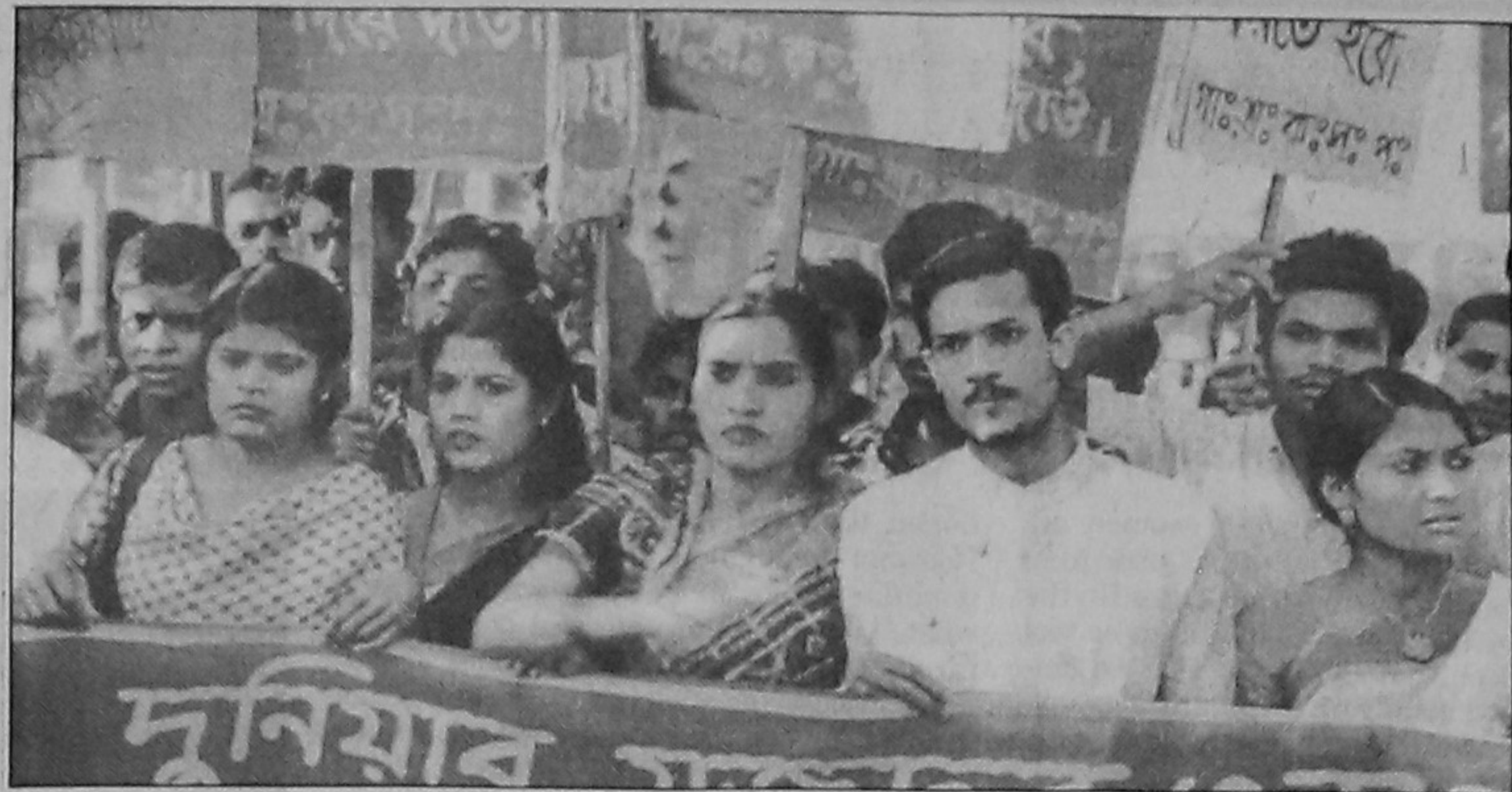
Garment workers staged a demonstration in the city yesterday demanding payment of arrears.