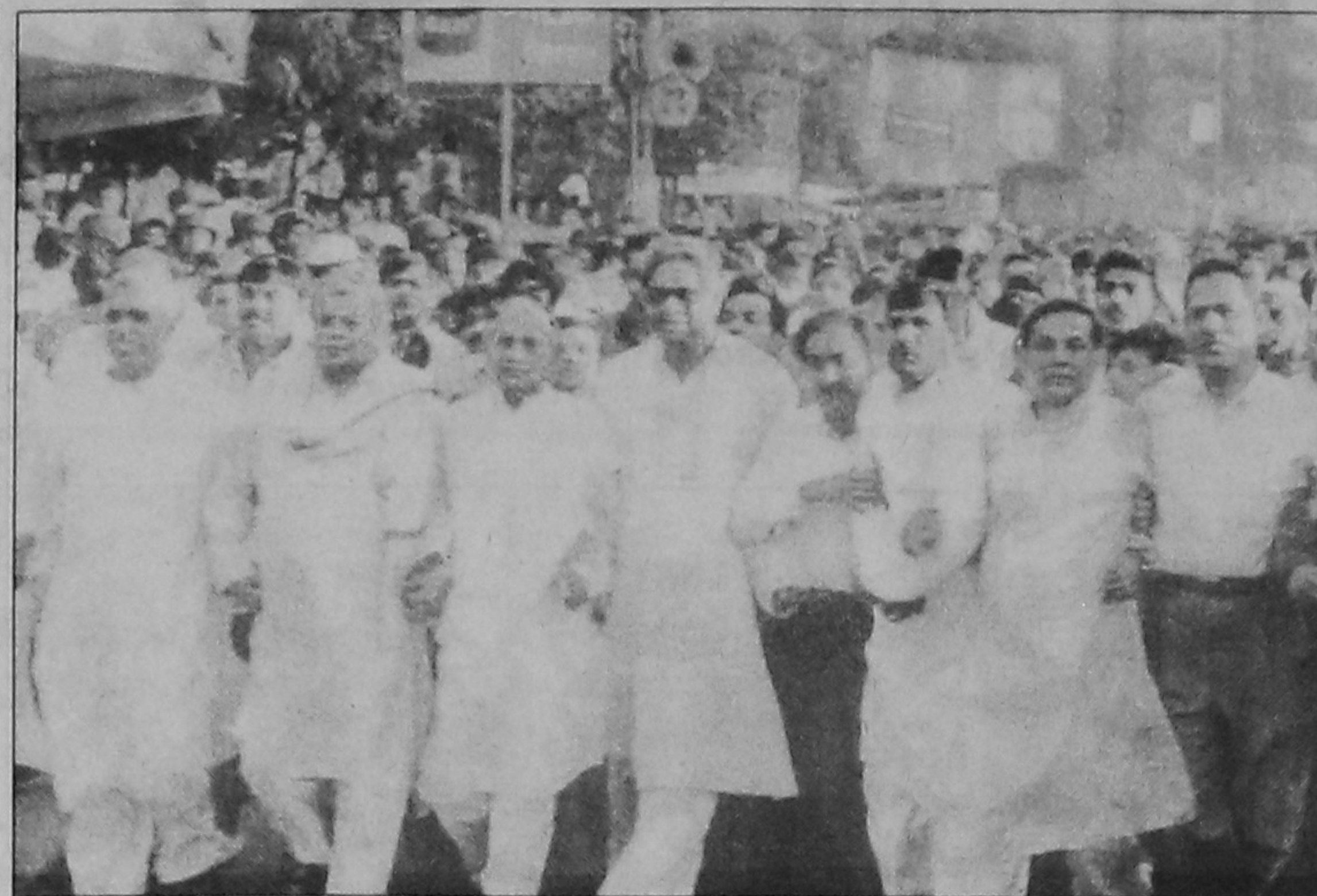
Awami League brought out a procession in the city yesterday to mark the 'Democracy killing Day'.

Researchers from 13 medical colleges, 12 post-graduate institutes, BSMMU and Dhaka and Jahangirnagar universities took part in the seminar.