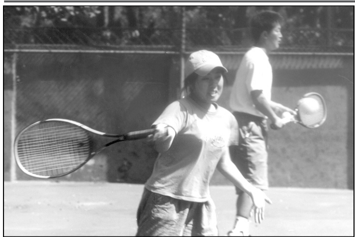
Two Japanese players, who will take part in the ITF Junior Tennis Championships, practising at the Ramna Tennis Complex yesterday.

In reply, the CCS were all out for 96 runs in 19.4 overs.