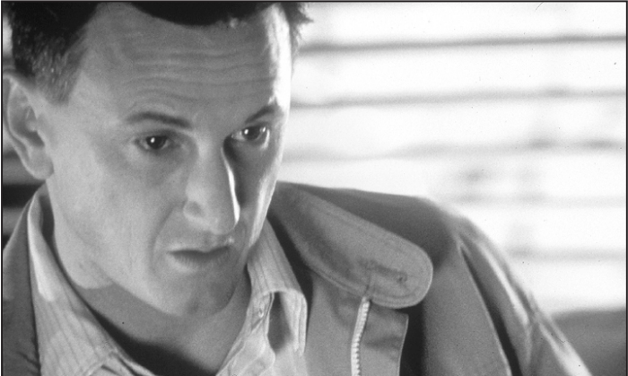
A scene from I am Sam shows Sean Penn who receives nomination for Best Actor

Awards. "Lord of the Rings," "Mind" and old-style song and dance extravaganza "Moulin Rouge" had recently emerged as the favorites in the once-crowded field for the Oscar