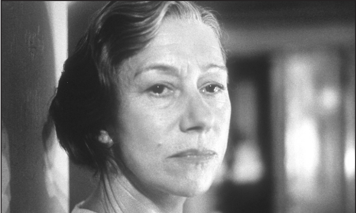
A scene from Gosford Park shows Helen Mirren who receives nomination for Best Supporting Actress

nominations, and they did not disappoint. "Mind," the story of schizophrenic maths genius John Nash, picked up nods for best film, best actor for Australian Russell Crowe --