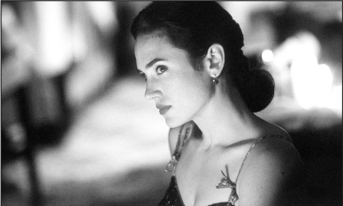
A scene from A Beautiful Mind shows Jennifer Connelly who receives nomination for Best Supporting Actress

last year's best actor winner -- best director for Ron Howard and best supporting actress for Jennifer Connelly. Tuesday marked Crowe's third consecutive Oscar nod and puts