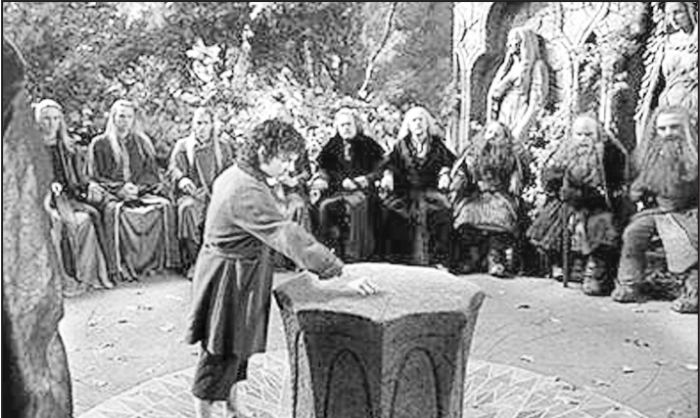
A scene from the movie Lord of the Rings that receives a total of 13 nominations in different categories

"Mind," the story of schizophrenic maths genius John Nash, picked up nods for best film, best actor for Australian Russell Crowe --