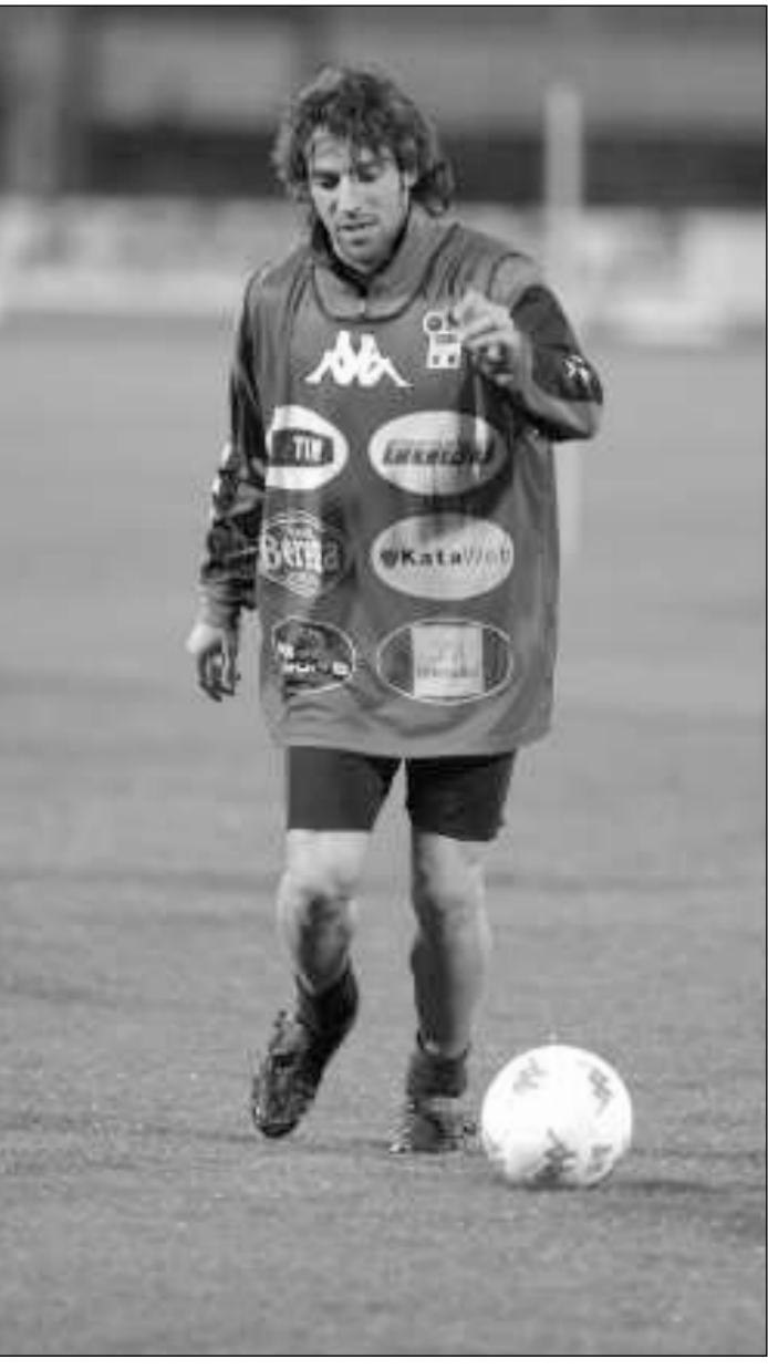
Italy's Alessandro Del Piero trains at the Cibali stadium in Catania, Sicily on February 12 ahead of the friendly game against the United States.

Slovenia face Spain, South Africa and Paraguay in their opening round group in the World Cup. China will be up against Brazil, Turkey and Costa Rica.