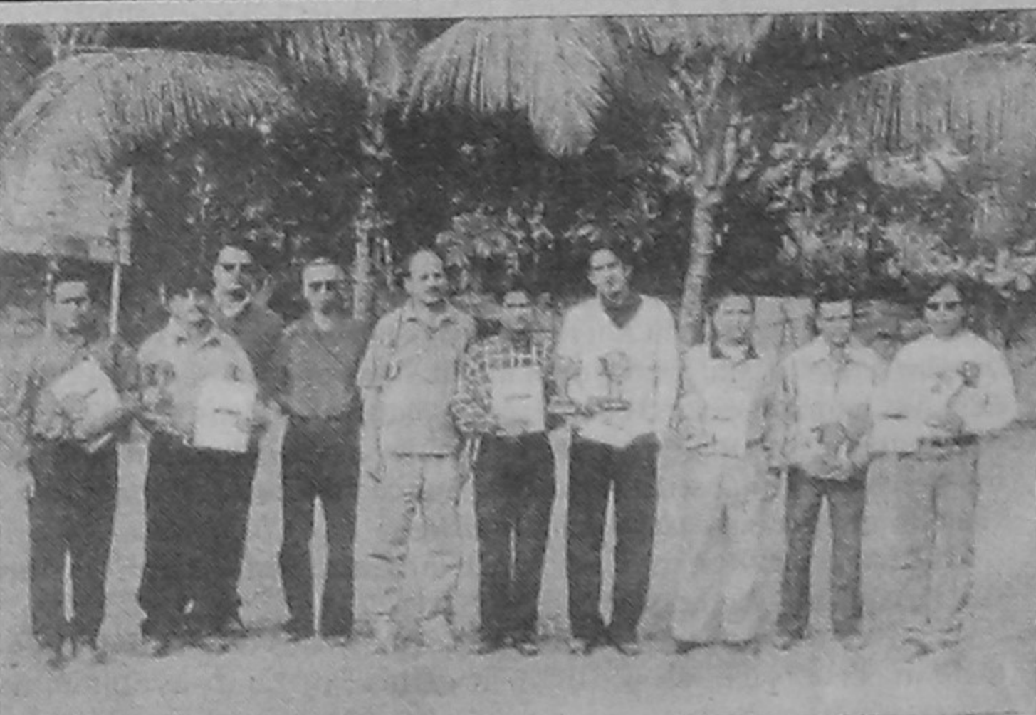
Unitrend Limited, a leading advertising agency, honoured ten of its employees who have completed 10 years of service in this agency at a ceremony in the city recently.