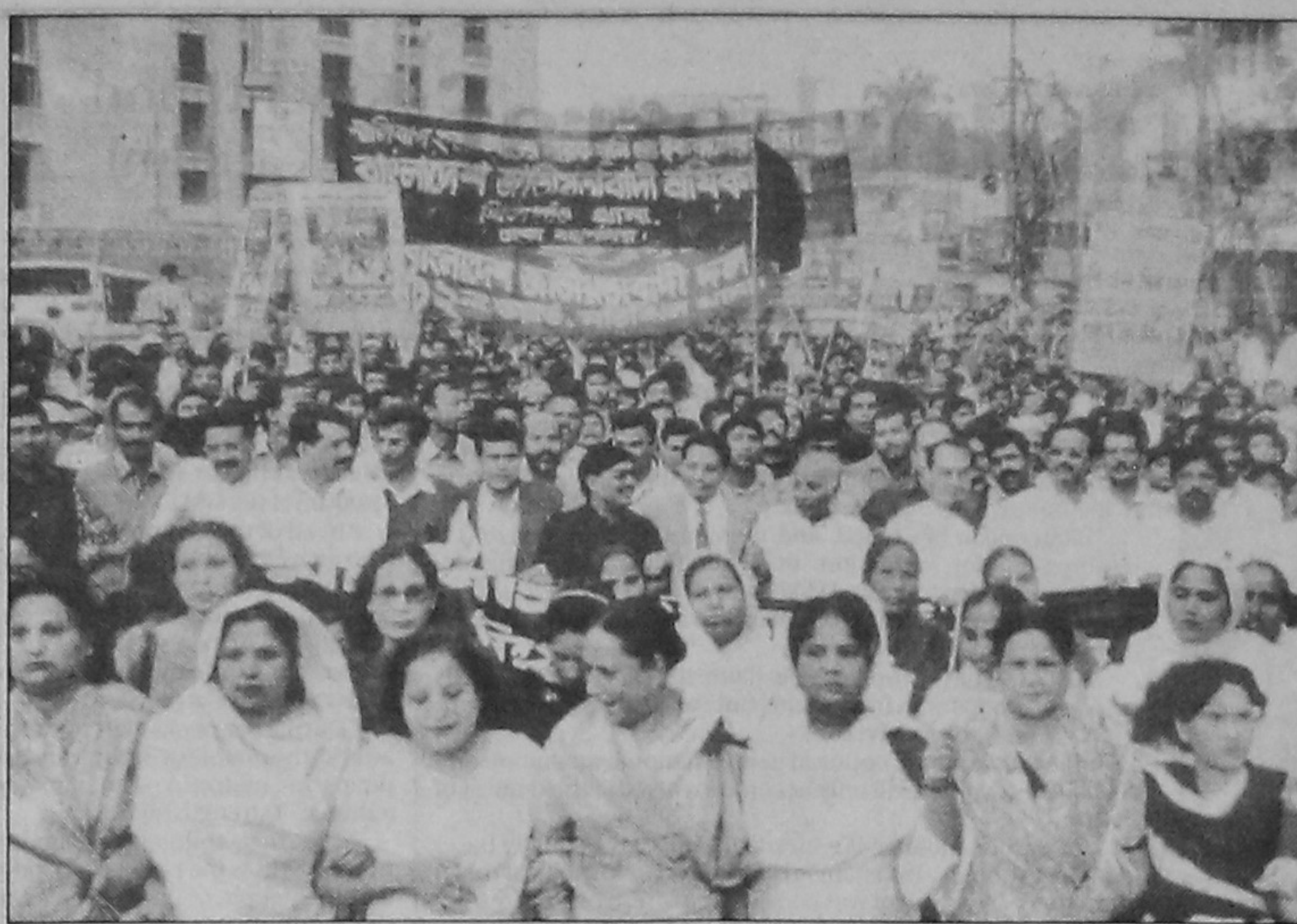
BNP and its front organisations brought out a mourning procession in the city yesterday in commemoration of those who were killed in a shoot-out at the Malibagh crossing last year.

It also said the supply of election materials to polling stations was also adequate.