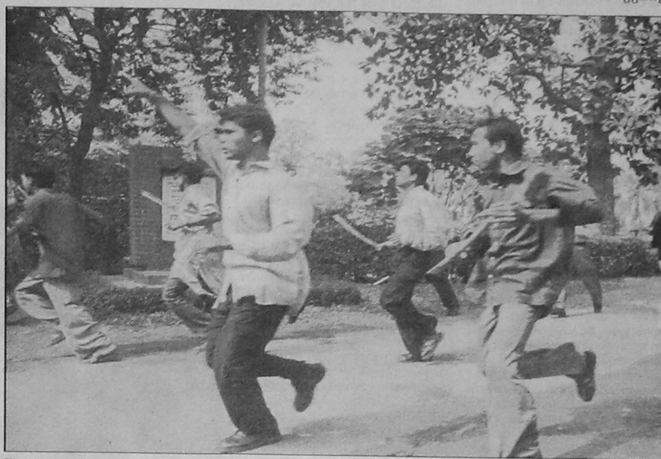
Terror on the campus