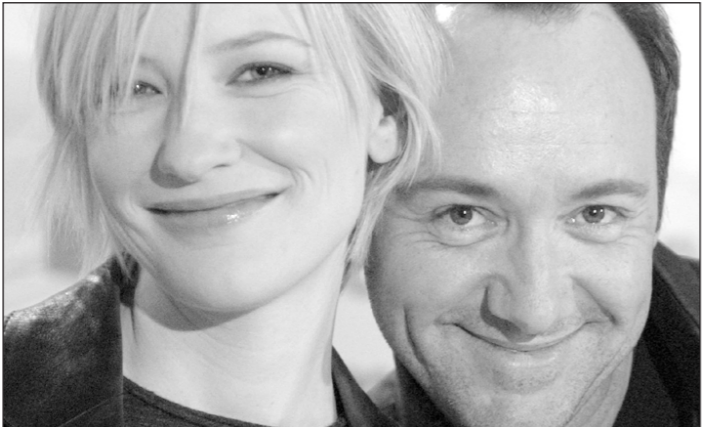
Actors Cate Blanchett (L) and Kevin Spacey (R) smile for the photographers during a press conference in Berlin at the 52nd Berlinale international film festival, 11 February 2002.

Spacey, 42, said he remembered the support he had received from mentors such as the late