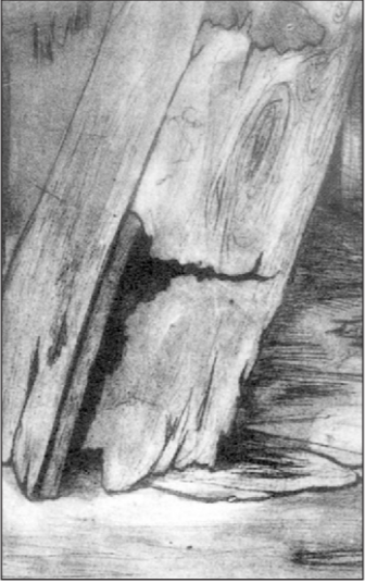
Isolet by Arifuzzaman

A semi-realistic and multi-dimensional world has emerged out of the thoughts of the young group of artists, many of who have just depicted their wishful thinking or perhaps have shown their affection to the childlike world once they desired to live in, during their days of infancy.