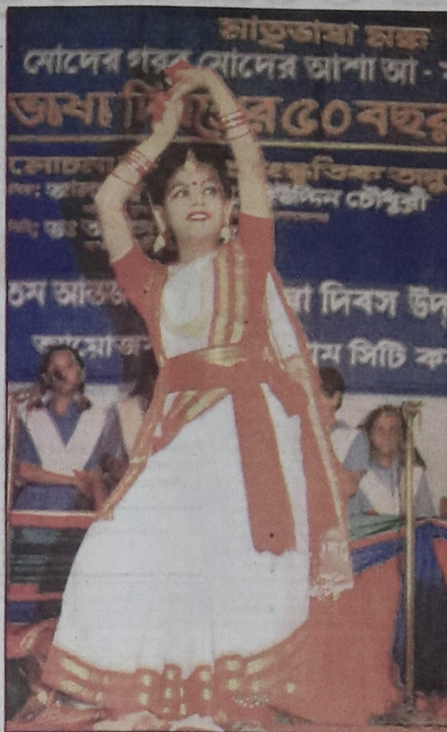
A girl performing a dance number at the inaugural ceremony of a 10-day programme marking 50 years of Language Movement at Laidighi Maidan in Chittagong yesterday. Chittagong City Mayor ABM Mohiuddin Chowdhury inaugurated the programme.

Of the arrested 655 are wanted by police and 648 accused in cases under investigation.