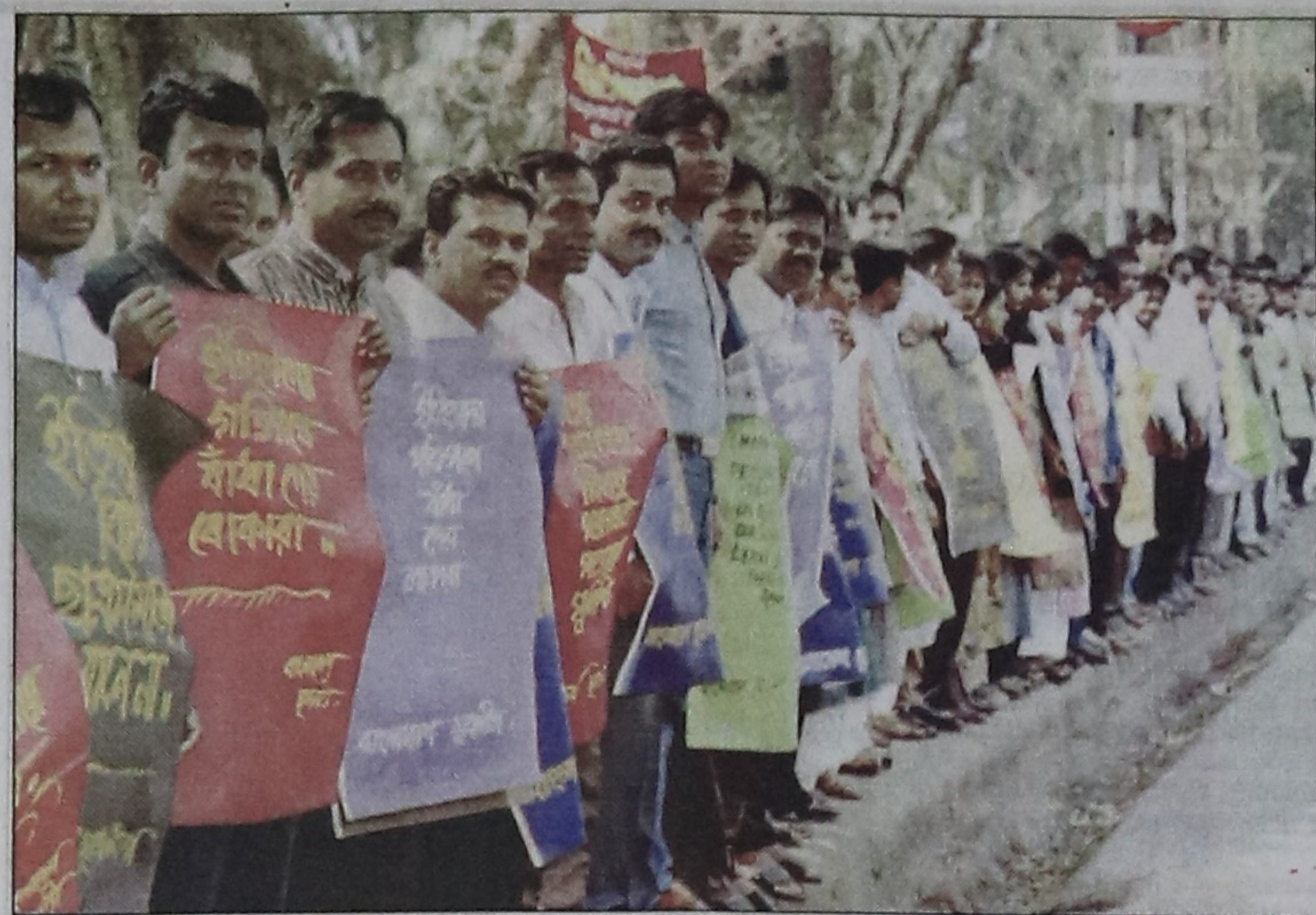
Bangladesh Chhatra League formed a human chain in front of the National Press Club yesterday protesting the distortion of history in the textbooks of this academic year.

A discussion titled 'Recognition of 21st February as International Mother Language Day is the diplomatic achievement of Sheikh Hasina' will be held with former finance minister Shah AMS Kibria as chief guest. Bangabandhu Sangskritik Jote has organised the discussion. Venue: National Press Club. Time: 4.00pm.