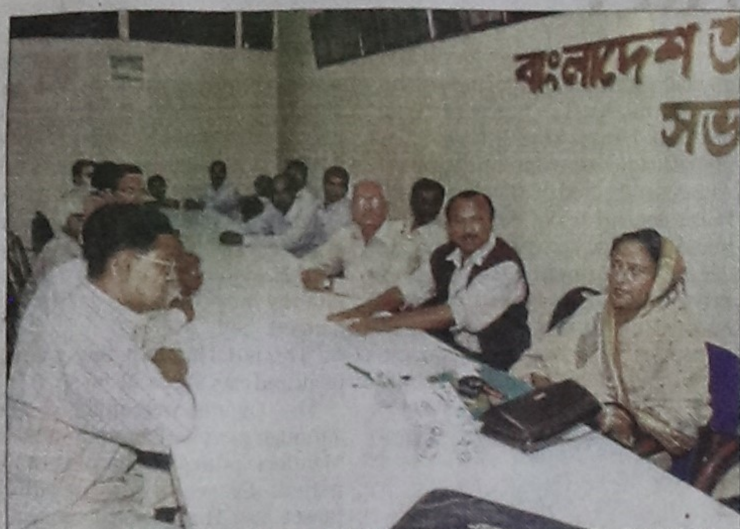
Opposition leader and Awami League chief Sheikh Hasina exchanged views with the leaders of Dhaka Bidyut Samik League at the party's central office in the city yesterday.