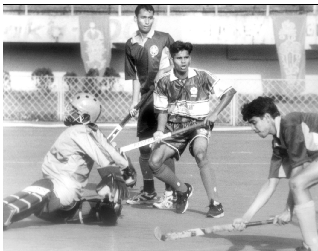
An Usha Krira Chakra attack in front of the Sadharan Bima post during their Jamuna Bank Club Cup hockey tournament encounter at the Maulana Bhasani National Stadium on Saturday.