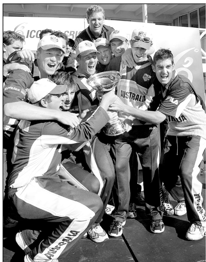
ON TOP OF THE WORLD! Australian Under-19 cricketers having a party over the World Cup in Christchurch on Saturday.