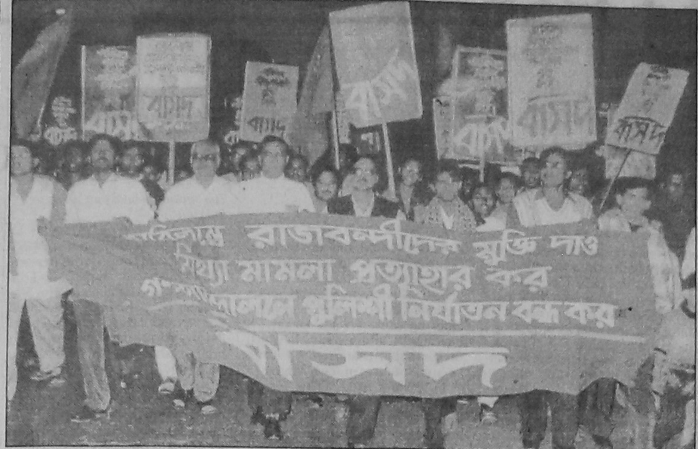
Bangladesher Samajtantrik Dal (BSD) brought out a procession in the city yesterday demanding withdrawal of 'false' cases against political activists and an end to police harassment during mass movement.

Meeting A meeting of the executive committee of North Bengal Journalists Forum (NBjF) will be held. Venue: Jatiya Press Club. Time: 11:00am.