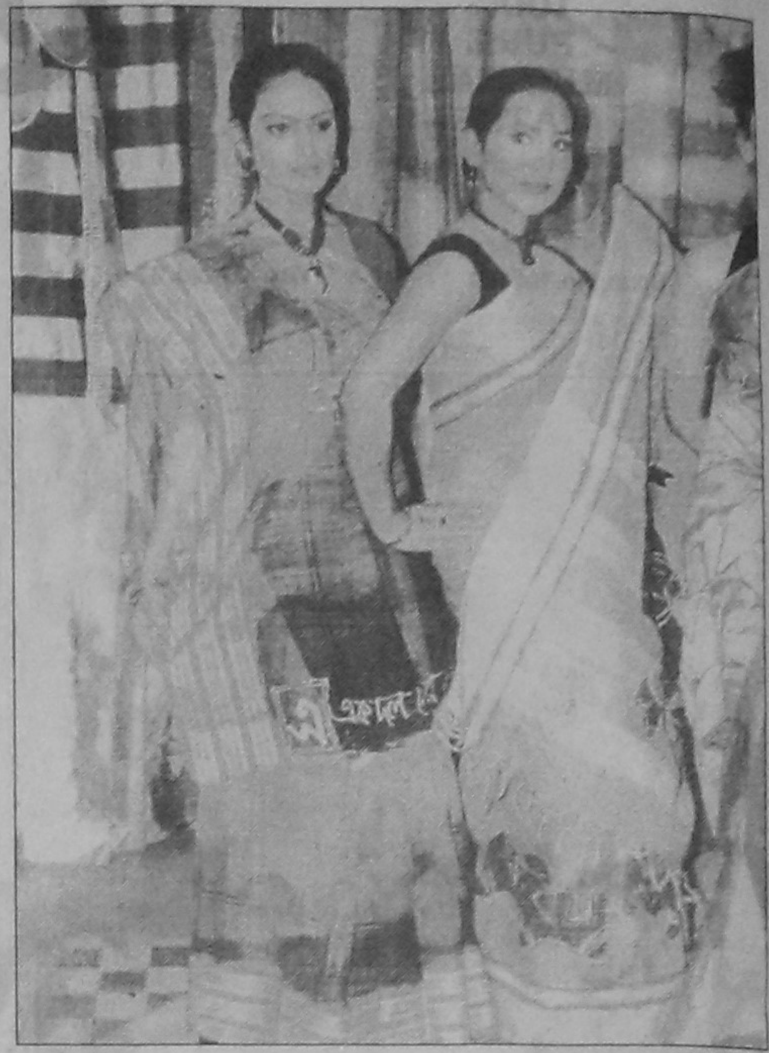
Altamira arranges a 21-day fashion show titled "Ballads and Colours of Ekushey" at its gallery yesterday.