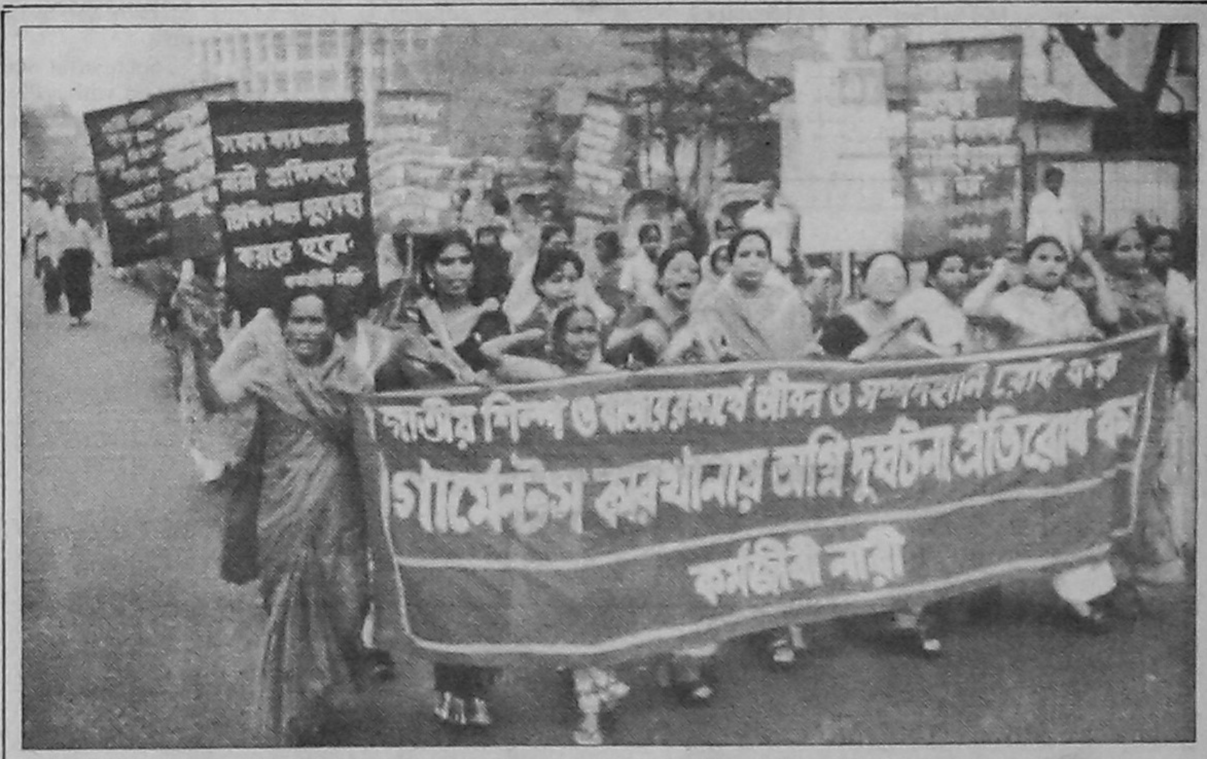
Karmajibi Nari brought out a procession in the city yesterday demanding effective measures to prevent fire incidents in the garments factories.