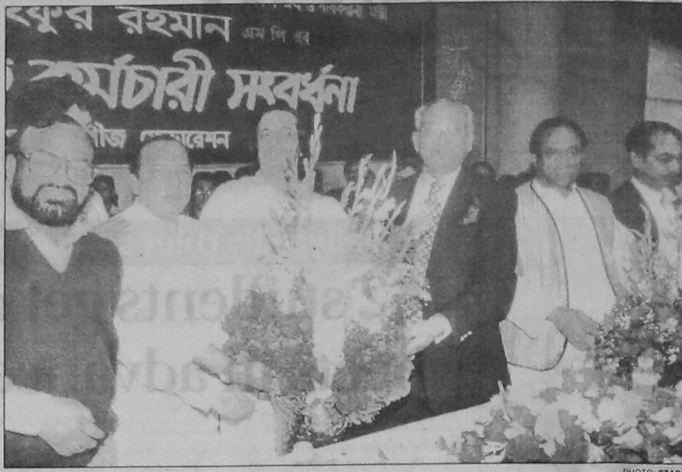
Bank Employees Federation accorded a reception to Finance and Planning Minister M Saifur Rahman at Patan Maidan in the city yesterday.

STAFF CORRESPONDENT Fair Election Monitoring Alliance (FEMA) will monitor all municipal elections to be held on February 12 through its district chapters by deploying mobile teams as well as stationary observers. The National Committee of FEMA has decided to observe the polls in all the 213 polling stations of 15 Pourashavas under 13 districts considering the importance of the municipal elections in urban life, said a press release. FEMA has already geared up its district committees and necessary materials such as checklists etc. have already been dispatched to them. The Election Commission has also been requested to direct the Returning Officers of all the Pourashavas to issue accreditation cards to FEMA volunteers deployed to observe the polls. According to the Election Commission, a total of 2,77,908 voters will exercise their right of franchise to elect their representatives to their respective Pourashavas.