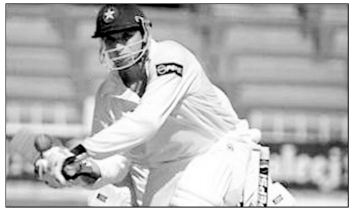
Shahid Afridi in action during his century knock.

Inzamam made 36 off 72 balls with four fours and a pair of sixes off Pedro Collins and Ramnarine. Yousof Youhana almost went the very next ball, but wicketkeeper Ridley Jacobs put down a simple catch.