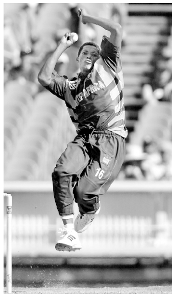
NTINI ... m-o-m

"You would like to increase the tempo and the way the trend has been going, finish off the innings with a flurry."