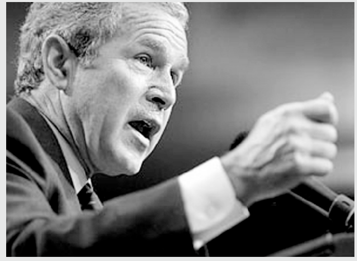
Resolving world disputes?

Mr. Bush clearly understood this when he made war against terrorism his main goal. He knows that unless he stems terrorism in its bud, it might grow into a monster to threaten the entire global security. History tells us that because both European nations and America ignored the Nazi threat before Hitler could endanger the global security, the Second World War had to be fought incinerat-