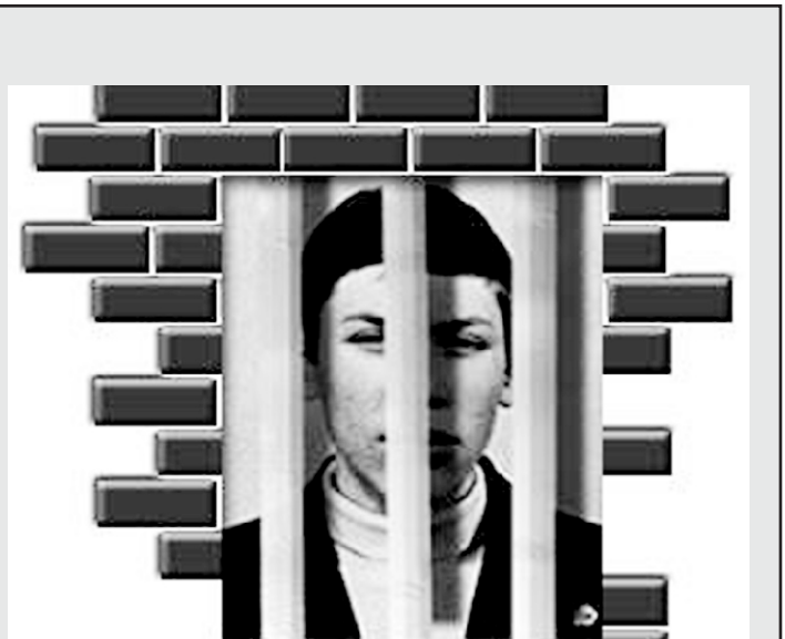
Barred from life

Through your daily I request the Home Minister to kindly treat these unfortunate people inside the jails as human beings by following the Jail Code and not as any queer animals from outer space.