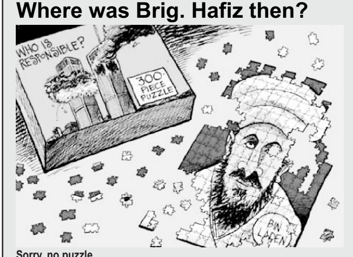
Sorry, no puzzle

Brig Hafiz's plea (February 4) for humane treatment of al-Qaeda prisoners leaves only one question unanswered. Where was the columnist's powerful sense of human rights when these very prisoners of today had enslaved an entire nation, imprisoned an entire gender, and demolished an entire culture a short six months ago?