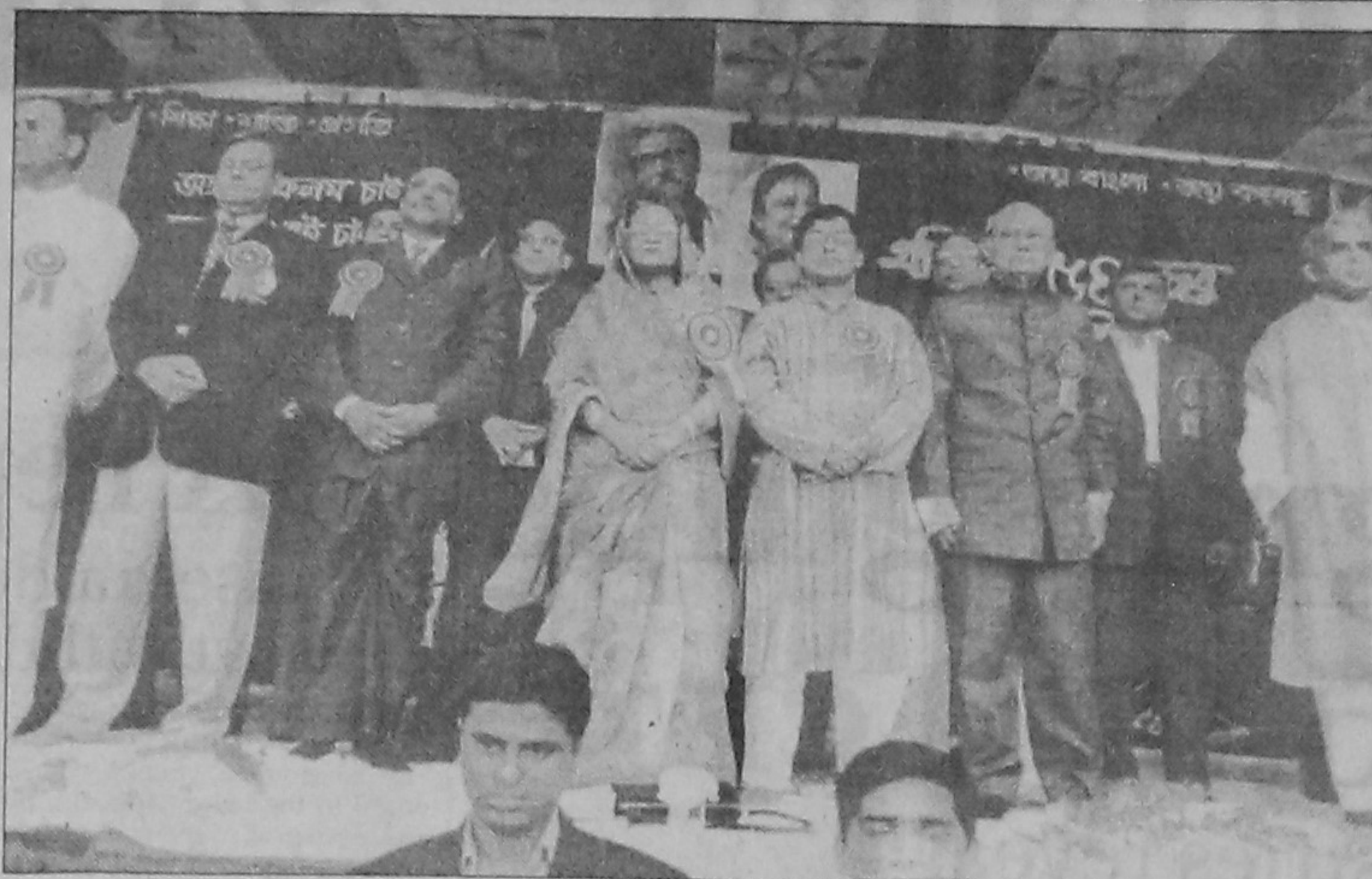
Leader of the Opposition in Parliament and Awami League president Sheikh Hasina and others observed a one-minute silence at a function marking the 54th founding anniversary of the Chhatra League at the Engineers' Institute auditorium yesterday in honour of the activists killed in violence across the country following the October 1 general election.

He urged the BNP leaders of Chittagong to convince those people who are opposing the construction of the new court building on the previous site. Similar architectural design has been made as of the old building for the construction of the new court building, he added.