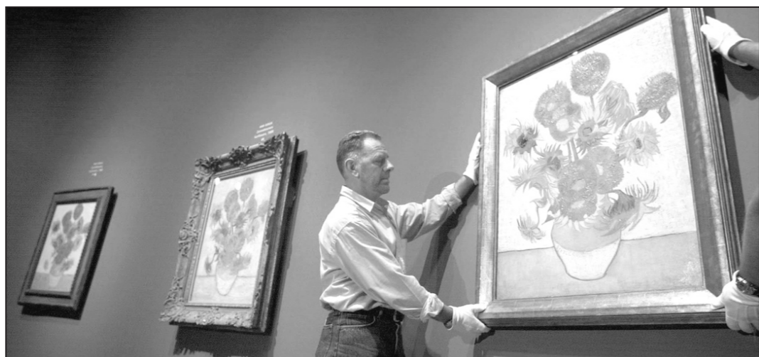
In the Van Gogh museum in Amsterdam yesterday a man hangs a painting of Vincent Van Gogh for the exhibition 'Van Gogh & Gauguin'. This is the first time three versions of the sunflowers will be shown together.