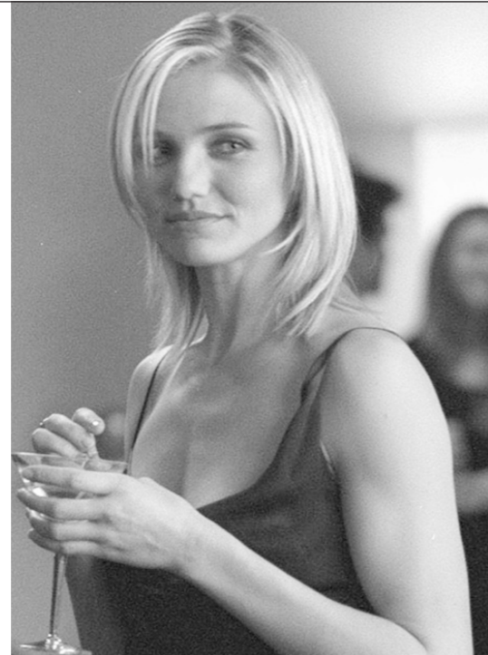
Actress Cameron Diaz was nominated for 'Outstanding performance by an actress in a supporting role' at the 8th Annual Screen Actors Guild Awards Nominations in Los Angeles on January 29, 2002