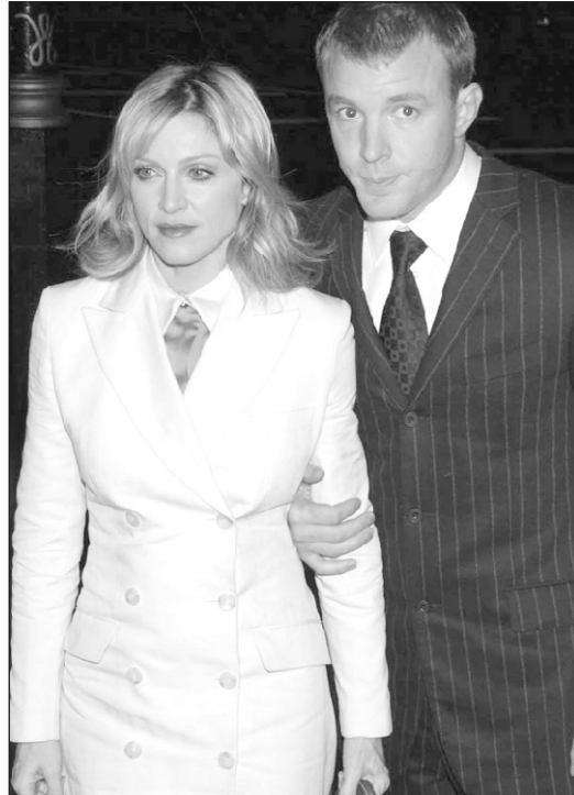
Pop superstar Madonna and her husband Guy Ritchie arrive at the National Portrait Gallery in London on January 29, 2002 to celebrate the launch of an exhibition of celebrity portraiture