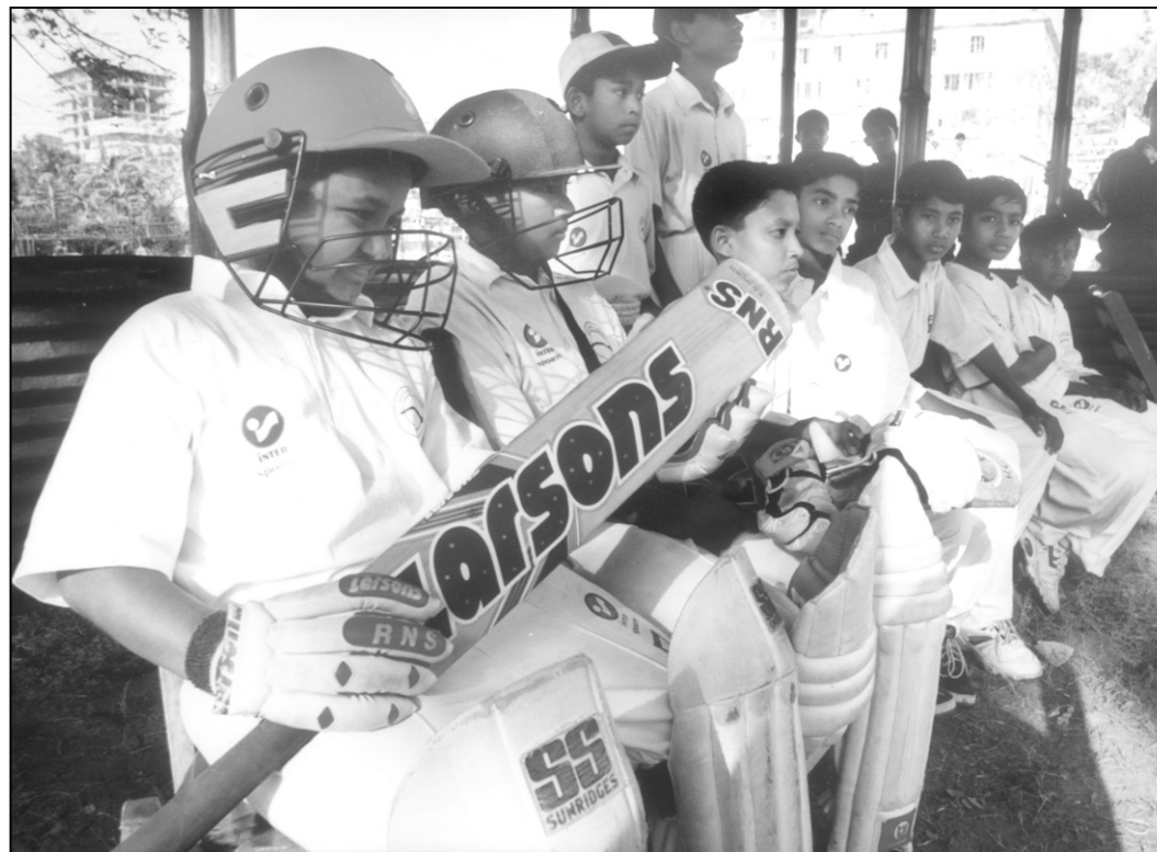
GOT TO WAIT FOR A WHILE! Young cricketers wait for their turn to bat during their under-13 tournament engagement at the Kalabagan Cricket ground yesterday.

A source, preferring not to be named, revealed that all the 12 Premier Division and ten First Division clubs have asked for the Board donation to form their teams.