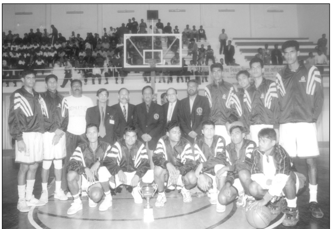
Players and officials of Bangladesh Navy team pose with the winner's trophy after beating Bangladesh Army in the FedEx Victory Day basketball final yesterday.