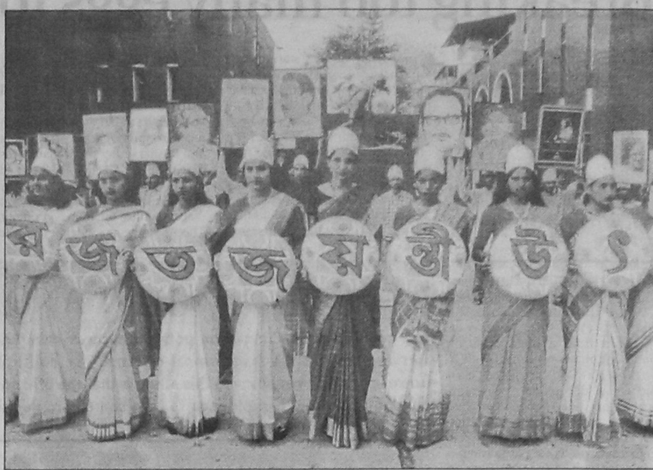
Hrishij Shilpi Goshthi brought out a colourful procession in the city yesterday as part of its silver jubilee celebrations.