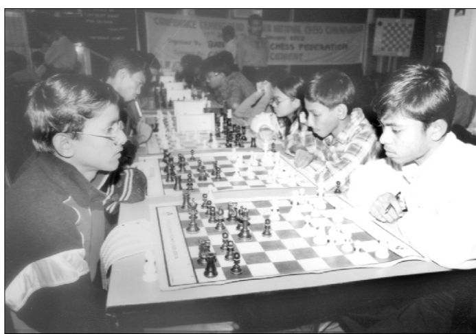
Scene from yesterday's National Sub Junior Chess Championship engagements at the federation office.

"In the first instance we realise we are here for the collective and if we did back a player it's an issue that must apply to all of our constituency and we would have to see if it's an issue that we would support."