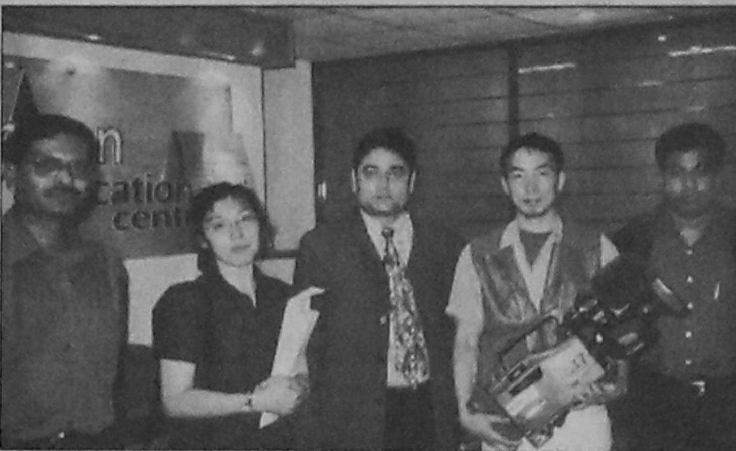
Technical representatives of Japan Broadcasting Corporation (NHK) visited the Grameen Star Education Centre at Panthapath in the city yesterday.

BSS, Dhaka Police recovered 18 firearms, two other weapons and 35 bullets from different parts of the country during the last 24 hours ending at 6:00 am yesterday.