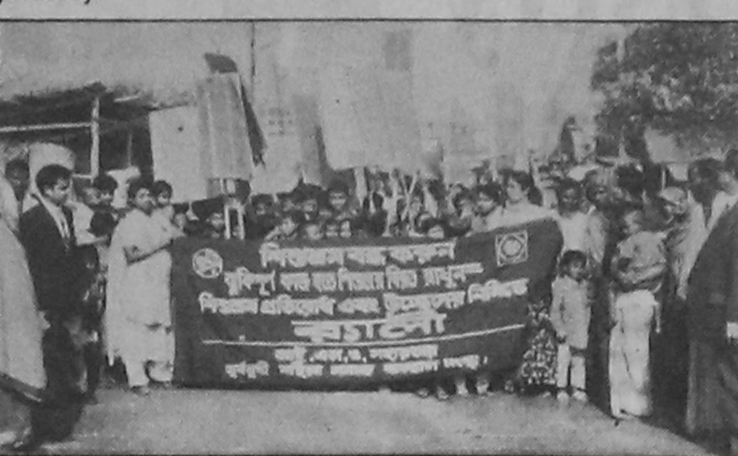
Surjankumari Mahila Samaj Kalyan Sangstha, a local NGO, in collaboration with ILO brought out a procession in the city yesterday on the occasion of launching a programme on prevention and elimination of child labour.