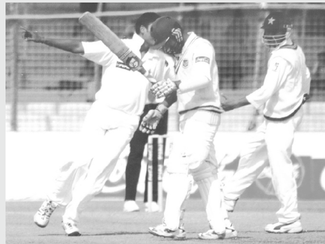
Cricket: Learning to lose...

Your editorial on Bangladesh cricket (January 20) caught my attention. Thank you for such a timely piece