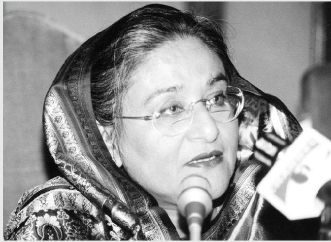
Hasina: Undemocratic leader?

I am surprised at Sheikh Hasina's wish to address the nation to criticize/challenge BNP's 100-days completion in power. If she wants to make a stance, she already has a venue called the parliament. Sheikh Hasina was elected to the parliament not only to address the mass media, but also to effectively represent the