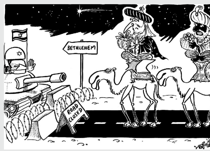
Israel: Occupation of the occupied?

However, Pakistan has repeatedly assured the world, that the nuclear weapons were made only for self-defense from India's naked nuclear threat.