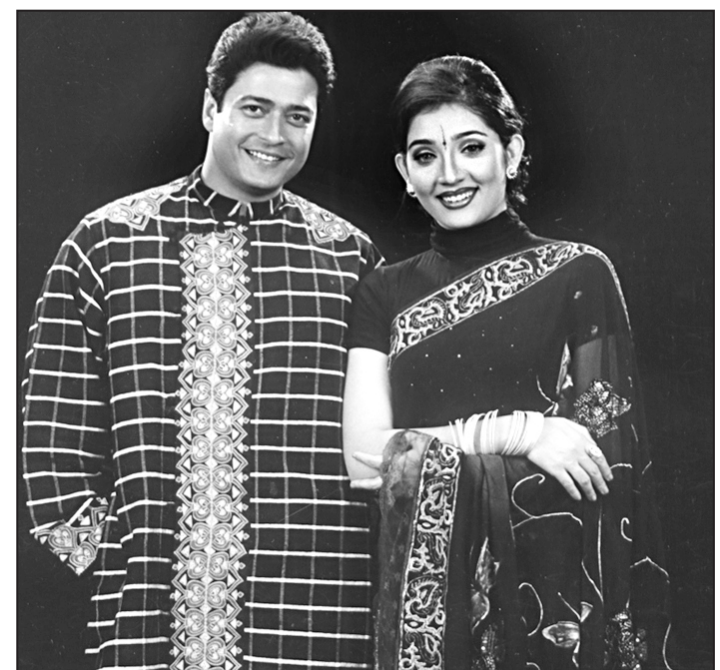
Henry's Heritage cater for both males and females

This exhibition will continue for one month.