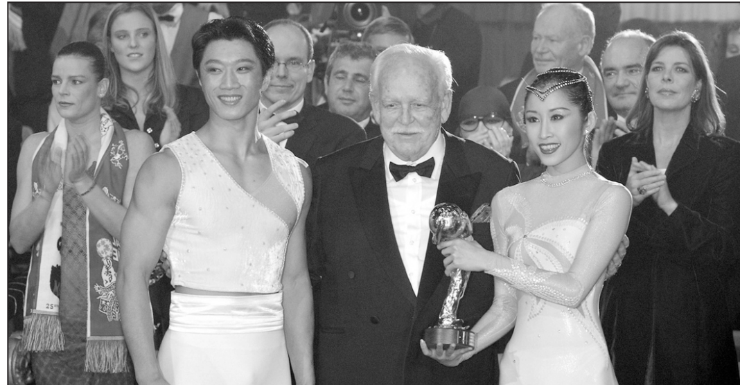
Prince Rainier (C) of Monaco poses late 22 January 2002 with two unidentified members of the Guangzhou acrobatic company after it won the Golden Circus award of the 26th International Circus Festival in Monaco.