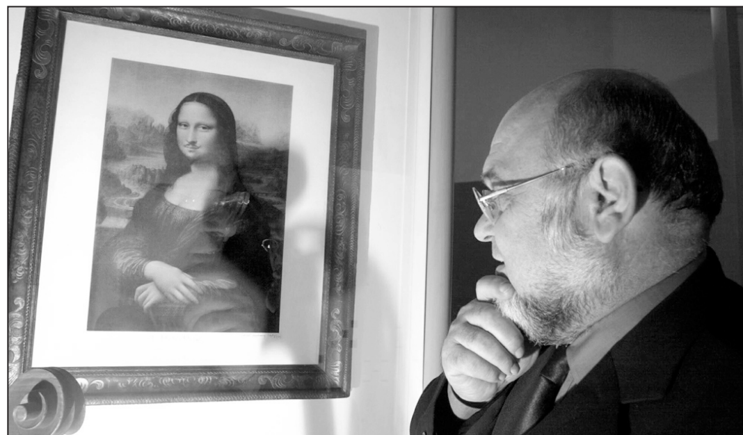
Chairman of the French Communist Party (PCF) Robert Hue watches a moustachioed Mona Lisa by dadaist painter Marcel Duchamp, lent out by his party for the first time for an exhibition 23 January 2002, during the opening of the Paris Capital of Arts 1900-1968 exhibition at the Royal Academy of Arts in London.

A dazzling star in Bangladeshi fine arts, Shahabuddin has so far bagged a good number of prestigious awards in both national and international arena. One of the world's fifty Master Painters, Shahabuddin has been staying in Paris as a professional painter since 1974.