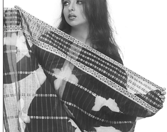
Butterfly print is an innovative design by Henry's Heritage

All the dresses displayed at the exhibition have colourful butterflies in them. According to Sharukh these butterflies in the anchal will be able to reflect into the minds of the one