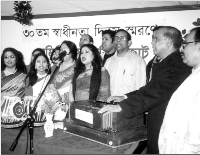
The Jote observes 30th Anniversary of Independence of Bangladesh at Dhaka cafe, Queens, New York

The Jote holds programmes to mark important days of our political and cultural calendar. It organised Victory Day programme on 16 December, 2000 at Queens, New York and International Language Day programme at the Shahid Minar, built as the similar design of Dhaka Shahid Minar, at Astoria annex Park New York, on Language Martyr Day in 2001. It also celebrates Independence Day at Dhaka Cafe Restaurant, New York and observers Pehela Baishakh (Bangla New Year),