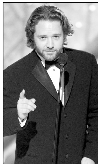
Australian actor Russell Crowe delivers a speech during the 59th Annual Golden Globe Awards yesterday. Crowe won the Best Actor in a Motion Picture - Drama for his role in "A Beautiful Mind".

antipodeans had tried to sit at the same table. "They didn't let us. We would have been too rowdy," said the 34-year-old who had also been nominated for a second award