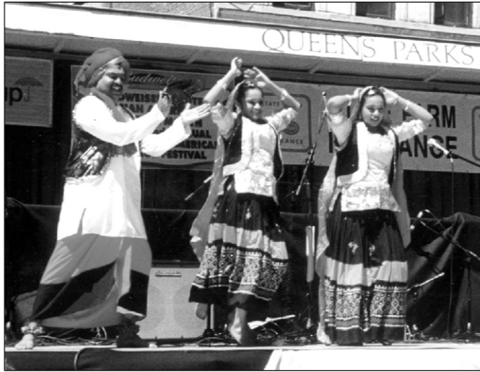
Cultural performance by the artists of the Asia Pacific programme organised by the Jote at Queens Park, New York