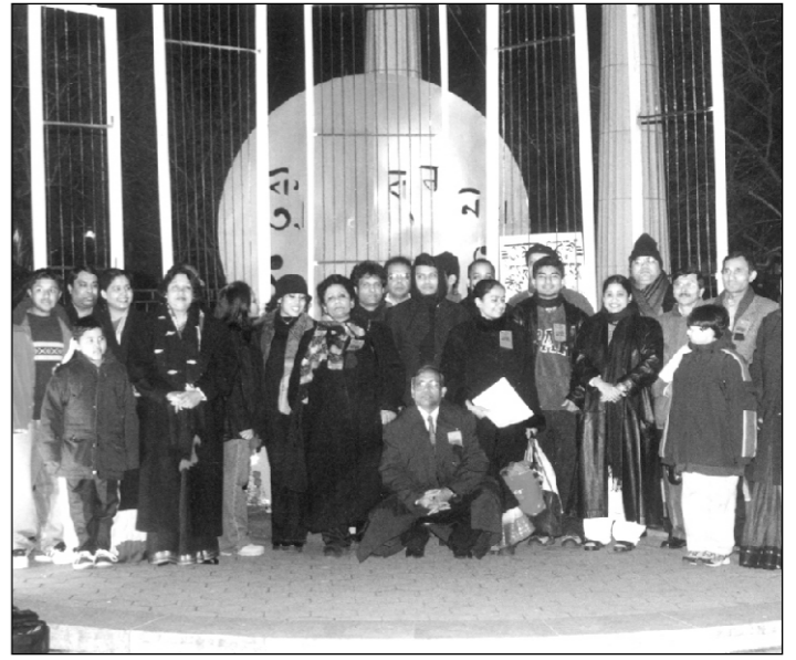
The Shahid Minar, built by the Jote, at Athens Park New York

Prof. Anisuzzaman spoke next terming minority repression as worse as it was in war torn situation in 1971. The repressions inflicted on the religious and ethnic minority groups can only be compared to that of '71," Anisuzzaman said citing a couple of such incidents that he himself witnessed. He called upon all expatriate