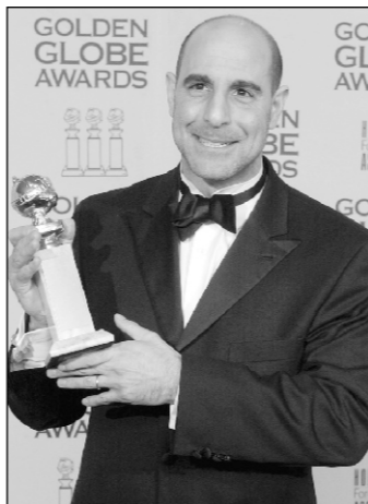
Actor Stanley Tucci holds his Golden Globe award for Best Performance in a Series, Miniseries or Motion Picture made for Television for "Conspiracy" at the 59th Annual Golden Globe Awards at the Beverly Hilton in Beverly Hills, CA, 20 January, 2002.

convinced me I can do it. I love to sing now," she said of her role in Australian director Baz Luhrmann's sumptuous production. After the show, Kidman noted