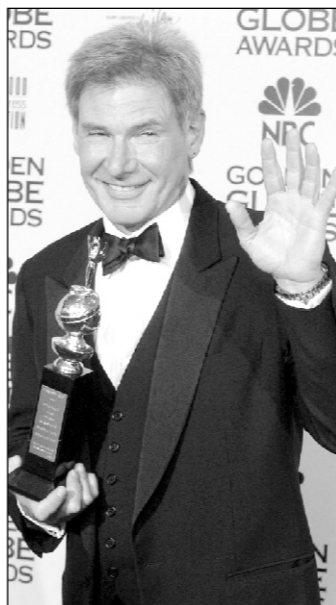
US actor Harrison Ford waves as he holds the Cecile B. DeMille award for lifetime achievement at the 59th Annual Golden Globe Awards.

convinced me I can do it. I love to sing now," she said of her role in Australian director Baz Luhrmann's sumptuous production. After the show, Kidman noted