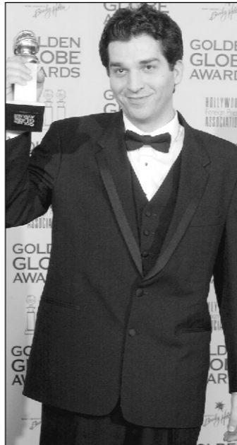
Director Danis Tanovic holds his Golden Globe award for Best Foreign Language Film for "No Man's Land" (Bosnia) at the 59th Annual Golden Globe Awards at the Beverly Hilton in Beverly Hills, CA, 20 January, 2002

the massive Aussie presence at the Globes -- including Rachel Griffiths who won best supporting TV actress for "Six Feet Under" and nominee Hugh Jackman -- saying the