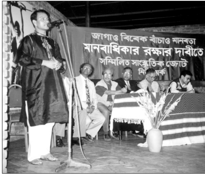
A section of the discussants

and civic rights of an individual. The discussants highlighted the ideals and aspiration of the war of liberation in 1971. They said that "minority repression" was