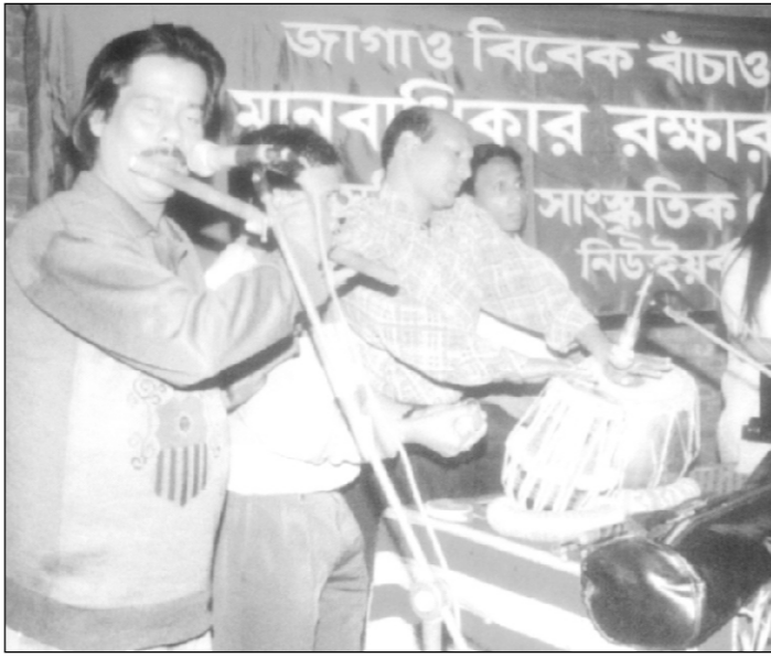
A musical recital by the Jote members

Referring to Shahriar Kabir's detention, the discussants