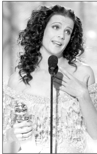
Actress Rachel Griffiths speaks after receiving her trophy during the 59th Annual Golden Globe Awards yesterday. Griffiths won the Best Performance by an Actress in a Supporting Role in a Series, Miniseries or Motion Picture Made for Television for her role in "Six Feet Under".

antipodeans had tried to sit at the same table. "They didn't let us. We would have been too rowdy," said the 34-year-old who had also been nominated for a second award