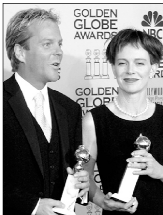
Actor Kiefer Sutherland (L) and actress Judy Davis (R) pose with their Golden Globe awards at the 59th Annual Golden Globe Awards at the Beverly Hilton in Beverly Hills 20 January, 2002. Sutherland won for Best Performance by an Actor in a Television Series-Drama for his role in "24" and Davis won for Best Performance by an Actress in a Miniseries or Motion Picture made for Television for her role in "Life With Judy Garland: Me And My Shadows."