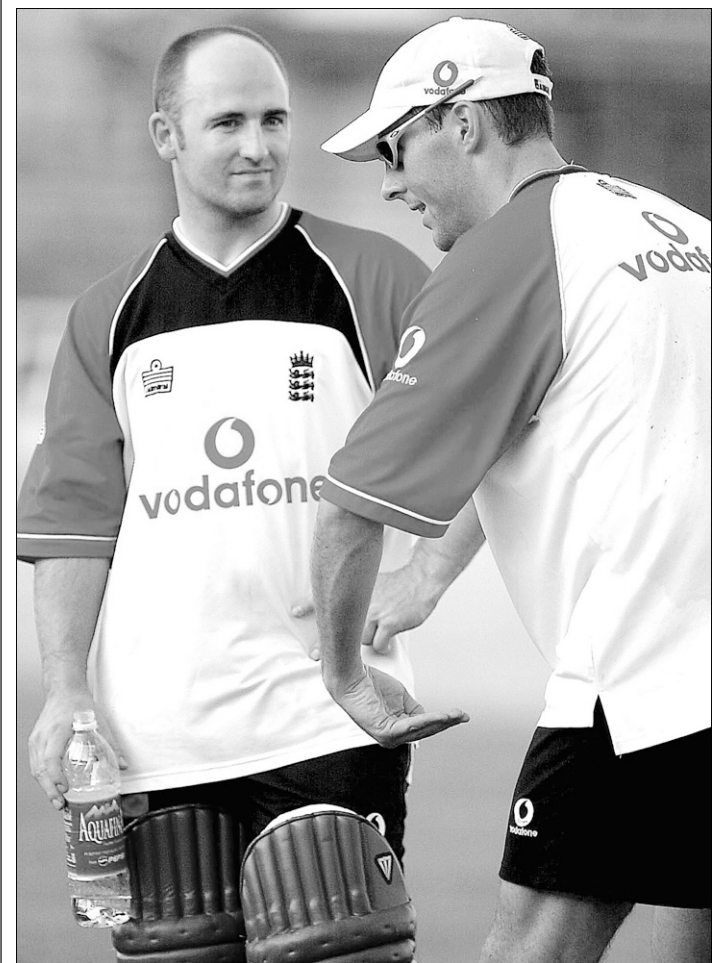
England star opener Marcus Trescothick (R) giving some batting tips to his teammate Jeremy Snape at the Barabati Stadium in Cuttack yesterday.