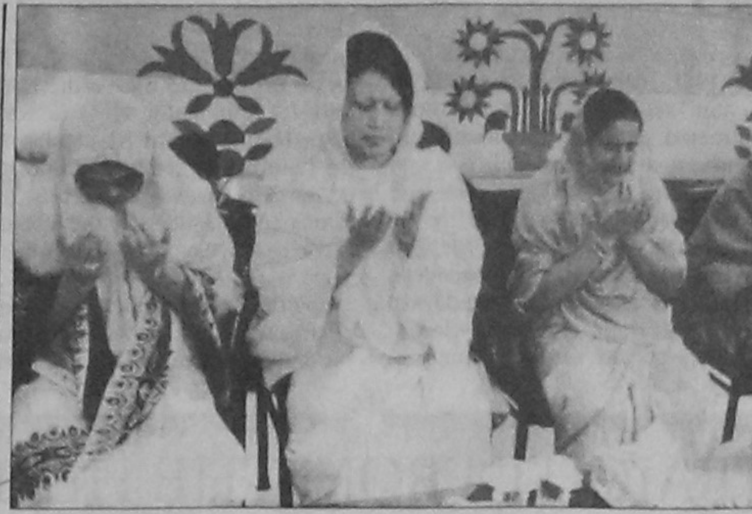
Prime Minister Khaleda Zia (left) and Opposition Leader and Awami League president Sheikh Hasina offering munajat on the concluding day of Biswa Ijtema at Tongi yesterday.

Health and Family Welfare Minister Dr Khandakar Mosharruf Hossain and Post and Telecommunications Minister Minister Aminul Haq will be present as special guests.