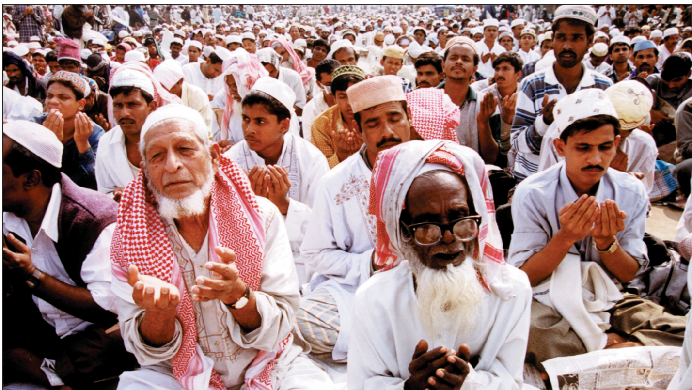
Devotees seeking divine blessings during Akheri Munajat on the concluding day of Biswa Ijtema yesterday.