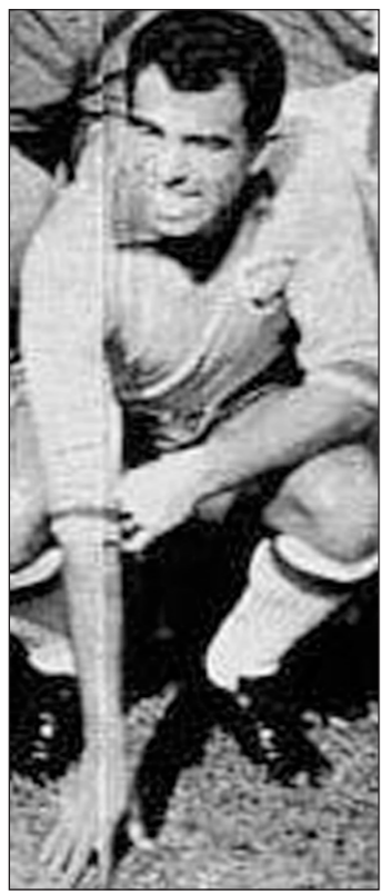
VAVA Brazil great Vava no more