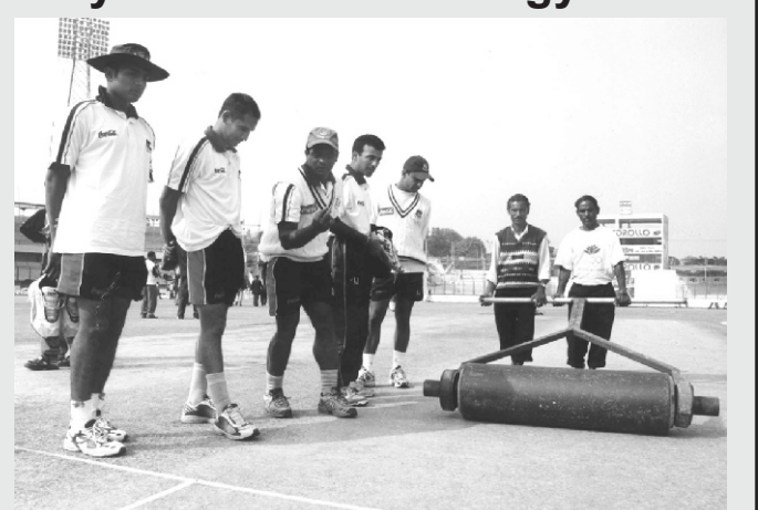
Bangla cricketers: Need a coach or gynaecologists?

The Daily Star is a spoilsport in the literal sense of the word. There was no need to make such big fuss about the appointment of three gynaecologists for the cricket test match, which has led to their replacement by more conventional doctors associated with the sport. The idea was a brilliant one.