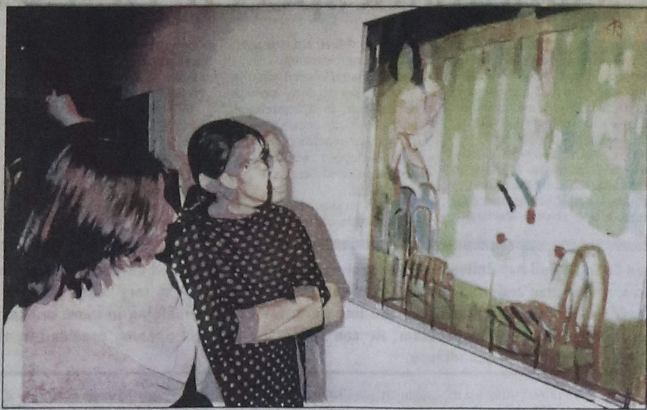
Visitors at a painting exhibition of Poliakov Vasily and Persidskiy Konstantin at the Russian Cultural Centre in the city yesterday. The cultural centre organised the exhibition to mark the 30th anniversary of the establishment of diplomatic relations between Russia and Bangladesh.

ADAB also welcomed the Prime Minister's commitment to take NGOs' opinion in formulating the NGO Policy and hoped that it will be involved in the process of formulating the policy.