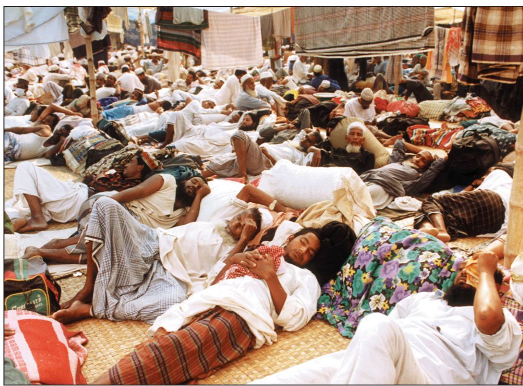
Devotees at Biswa Ijtima at Tongi take rest after Zohr prayers yesterday. The three-day Ijtima, the second largest congregation of Muslims after Hajj, ends today with Akheri Munajat.