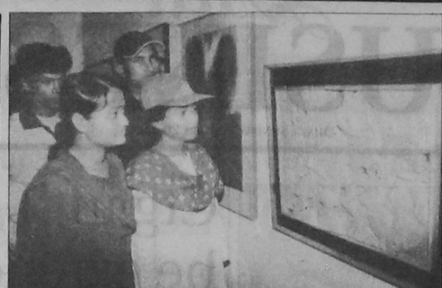
An exhibition of artworks began at the Zainul Art Gallery in the city yesterday on the occasion of 66th birth anniversary of Shaheed Ziaur Rahman.