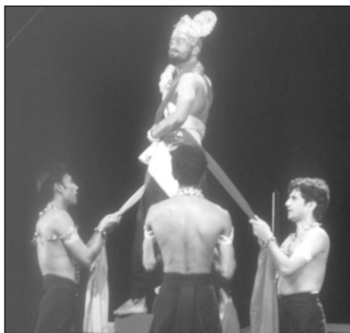
A scene of Urubhangam shows Duryodhana encircled by his warrior men

Surrounded by torch lights that appeared like forest fire,