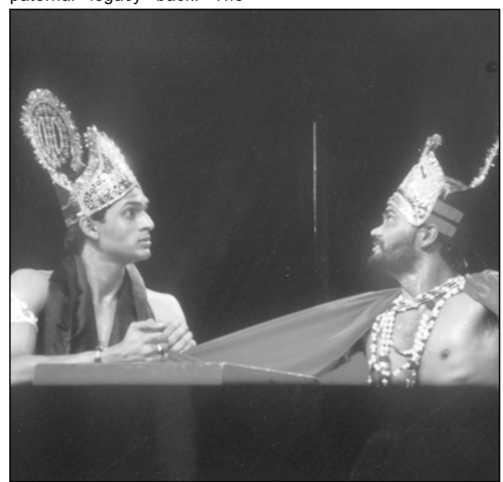
The young Ashwatthama rages in fury seeing the plight of Duryodhana

The 'Natyoutsav 2002', an initiation of some of the major drama activists and promoter of the subcontinent, would remain in the memories of the local enthusiasts for long and would further boost the ongoing movement of advanced theatrical exposition in the region.