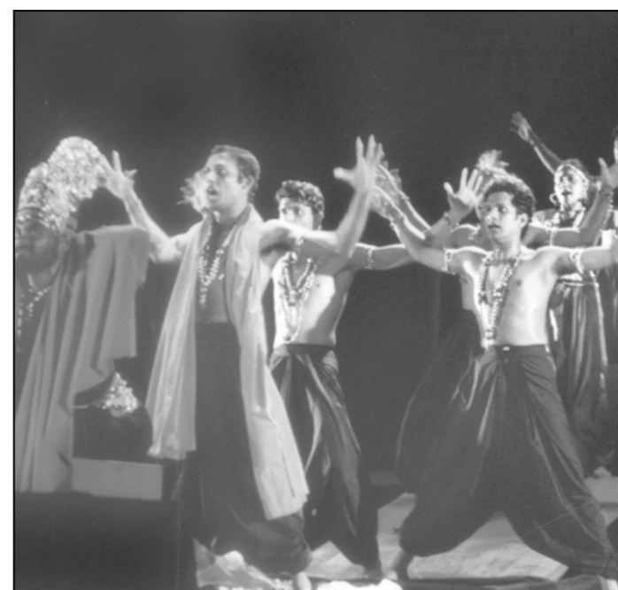
The role of the narrator is important in the play

Urubhangam, the one-act play received compilation of stage drama form by the CAT mem-