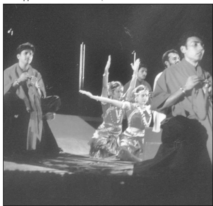
Members of the Center for Asian Theater maintain a high standard of performance