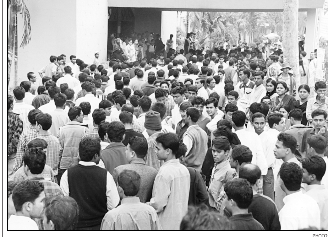
Admission hopefuls under the 'Kha' unit gather on the Dhaka University campus as tests were held yesterday.