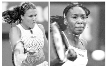
CAPRIATI V WILLIAMS