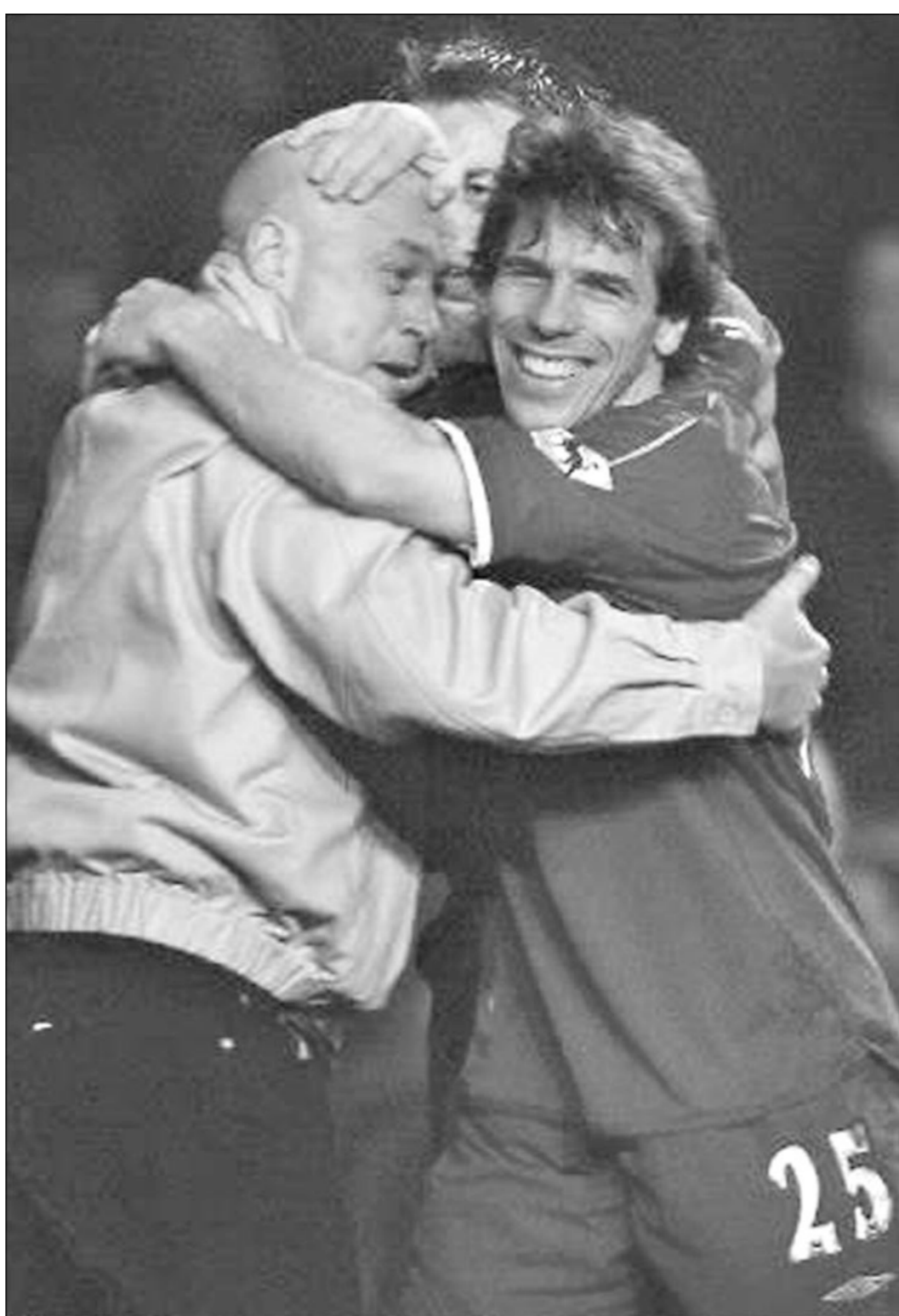
HE IS SPECIAL: Chelsea's Italian star Gianfranco Zola (R) is being greeted by a fan after scoring a wonder goal against Norwich City at Stamford Bridge on January 16.

Ipswich v Manchester City Arsenal v Liverpool