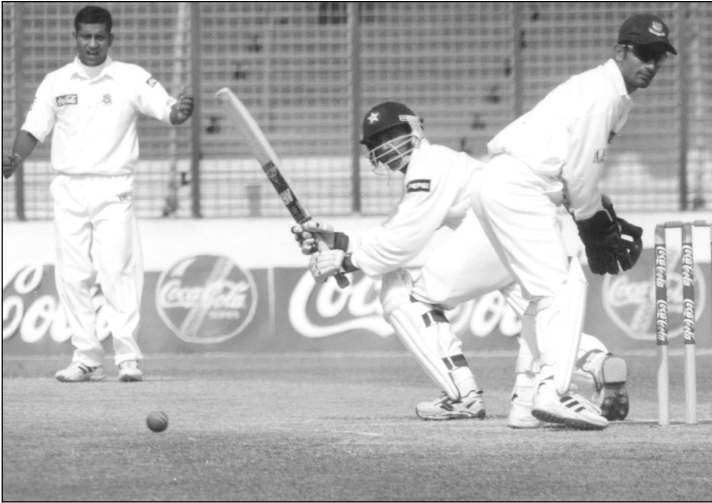
Star Pakistan bat Yousuf Youhana sweeps fine on way to his unbeaten 174 on the second day of the Coca-Cola second and last Test against Bangladesh at the MA Aziz Stadium in Chittagong on Thursday.

Tick the Correct Answers Post to The Daily Star Win attractive prizes. Competition closes at 8 pm Jan 18, 2002 and draw shortly afterwards.