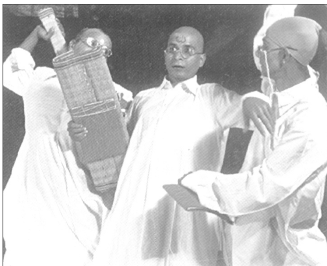
Scenes from 'Kahan Kabir'