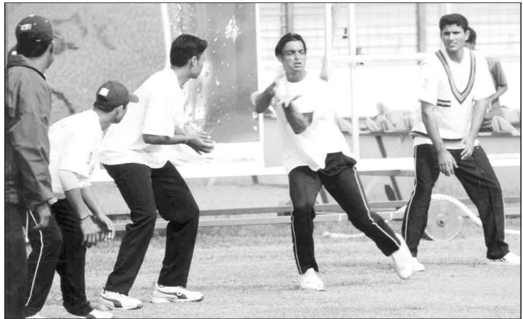
Pakistan speedster Shoab Akhtar (C), attempting a catch while fielding in a slip cordon at the MA Aziz Stadium yesterday.