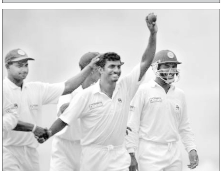
MAGICAL MOMENT: Sri Lankan spinner Muttiah Muralitharan (C) shows the ball to the crowd after capturing his 400th Test wicket during the fourth day of the third and final cricket Test against Zimbabwe at Galle yesterday. Muralitharan became the seventh bowler to achieve this feat in the 125-year history of Test cricket.

Zimbabwe faltered against the hosts' double spin attack in the morning session. Muralitharan, requiring three more wickets to complete 400, struck first ball when he trapped Grant Flower (19) leg-before and then bowled Travis Friend and Olonga.