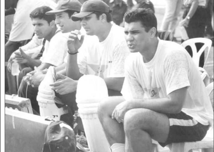
Pakistan skipper Waqar Younis (R), taking a break with teammates (L-R) Abdur Razaq, Wasim Akram and Inzamamul Haq during net practice at the MA Aziz Stadium yesterday.