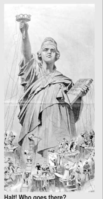
Halt! Who goes there?