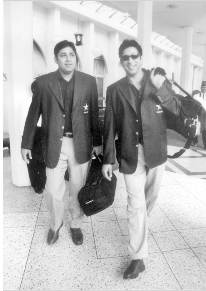
Pakistan vice-captain Inzamamul Haq (L) and all-rounder Wasim Akram leave the Sheraton Hotel on way to Chittagong on Monday.