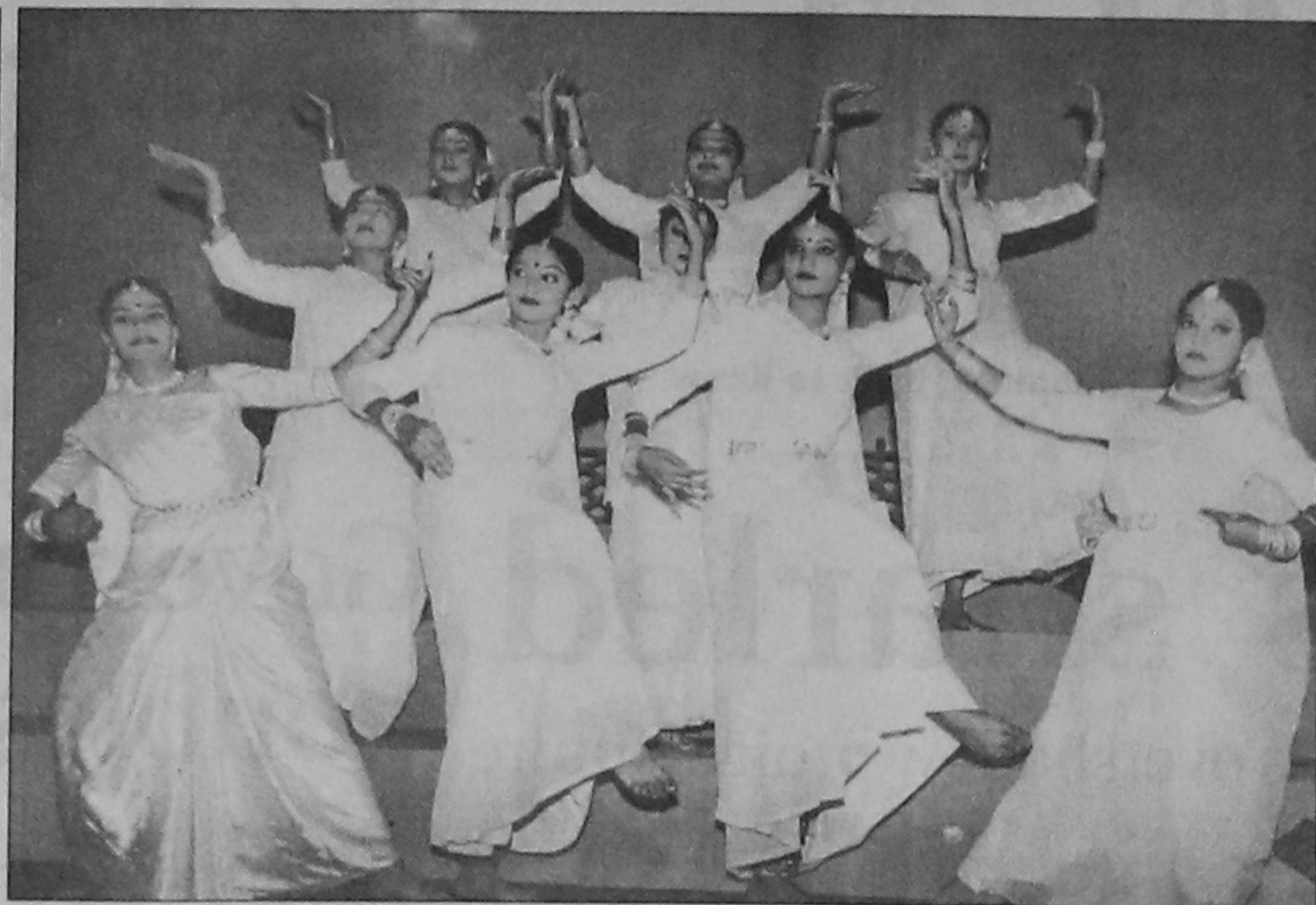
The members of Nrityanchal perform a 'Kathak' dance at Shishu Academy auditorium in the city on the last day of 'Nrityanchal Festival, 2002' yesterday.