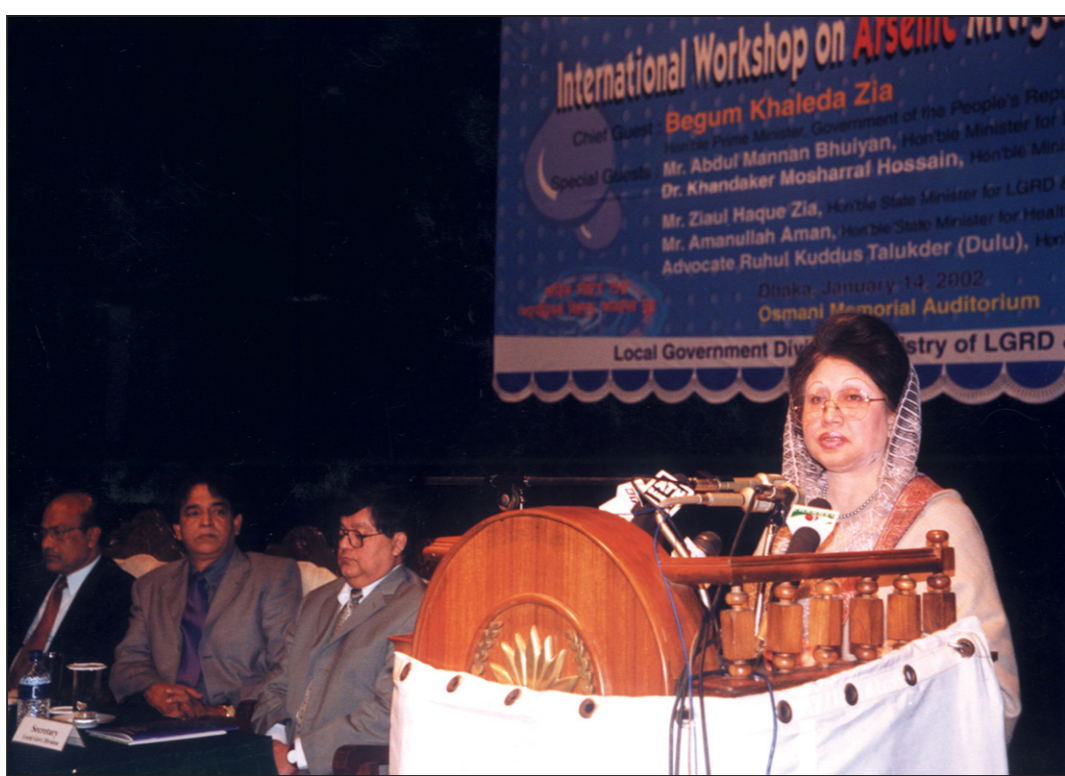
Prime Minister Khaleda Zia speaks at the inaugural session of International Workshop on Arsenic Mitigation at Osmani Memorial Auditorium yesterday.