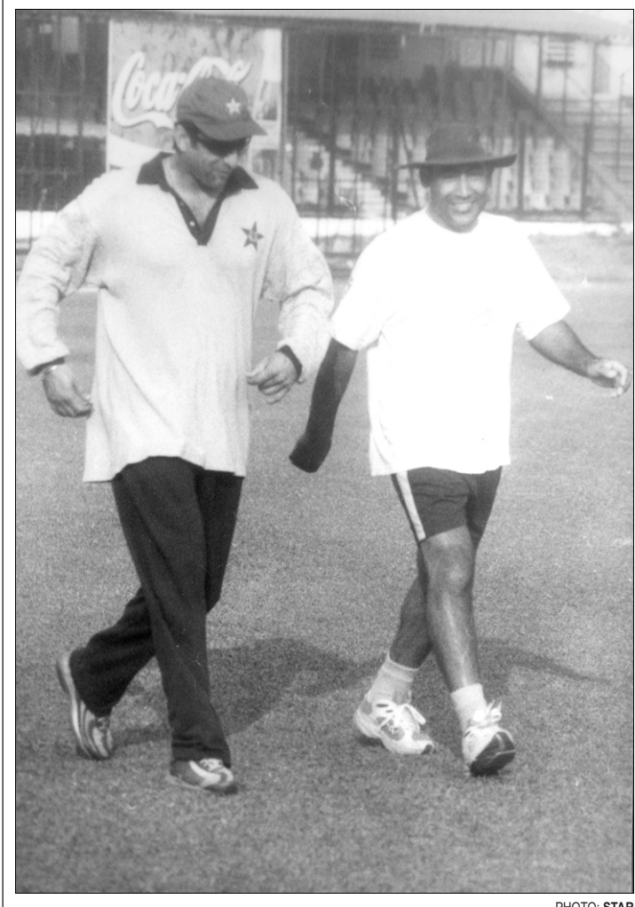
STILL ILL AT EASE: Pakistan superstar Wasim Akram (L) who did not take any further part in the first Test against Bangladesh after bowling only 2.3 overs on the opening day, walks along with coach Mudassar Nazar at the Bangabandhu National Stadium on Saturday. Akram did not practise on the day too.

"That's great!" "Don't thanks me, thank the Finance Minister."