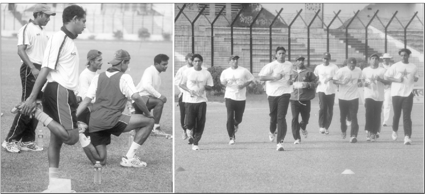
PRACTICE MAKES ONE PERFECT: Bangladesh (L) and Pakistan cricketers during their respective practice sessions at the Bangabandhu National Stadium on Saturday.