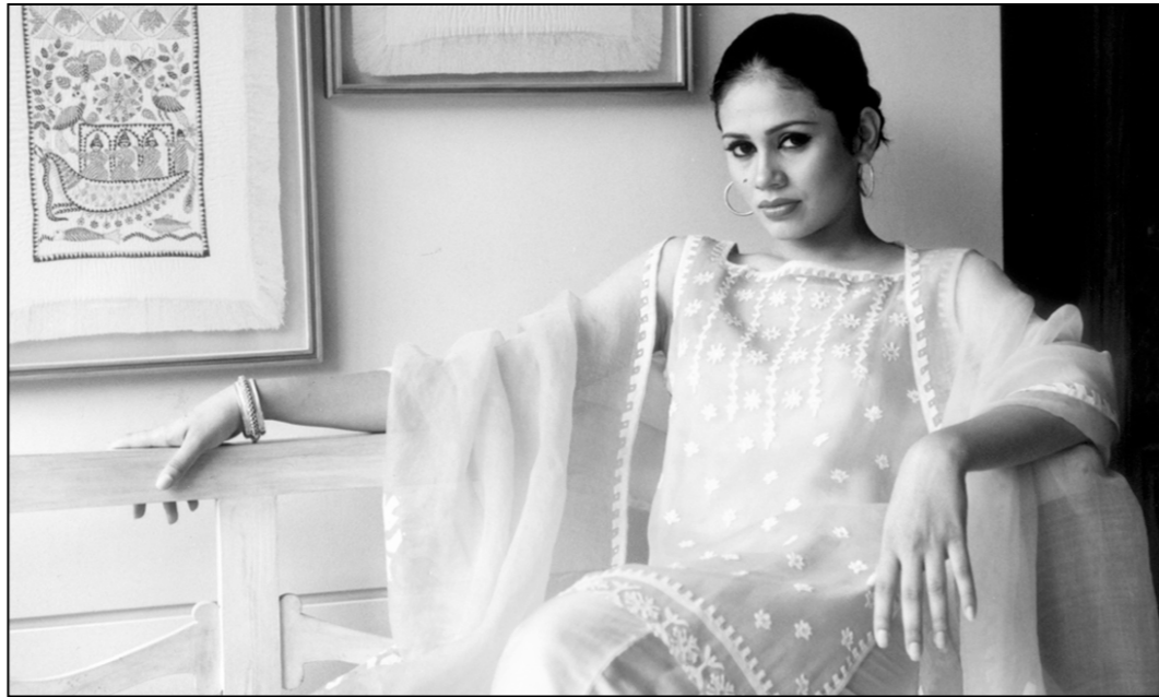
A salwar-kameez ensemble in lemon yellow with white Jamdani design from Mayasir's latest collection

will be fashion shows by two design houses participated by the leading models of the country. This event will take place in one of the five star hotels of the city and will contain thirty stalls. Along with the stalls of the fashion houses there will also be