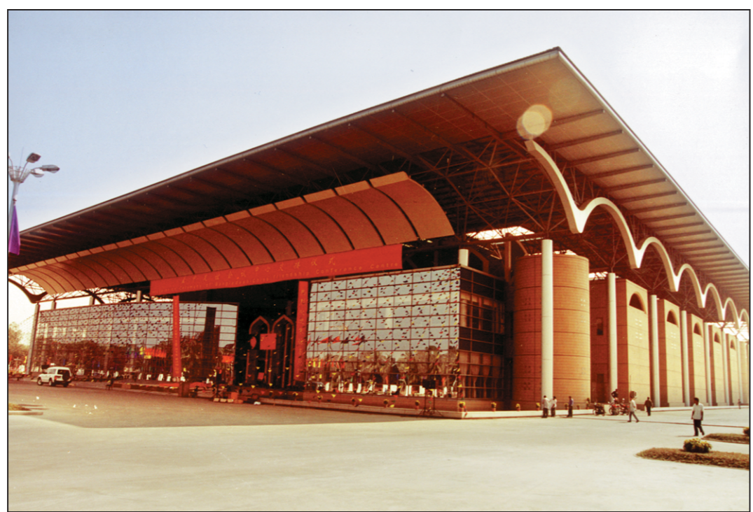
The Bangladesh-China Friendship Conference Centre built with Chinese financial assistance will be officially handed over to Bangladesh when visiting Chinese Premier Zhu Rongji inaugurates it today.