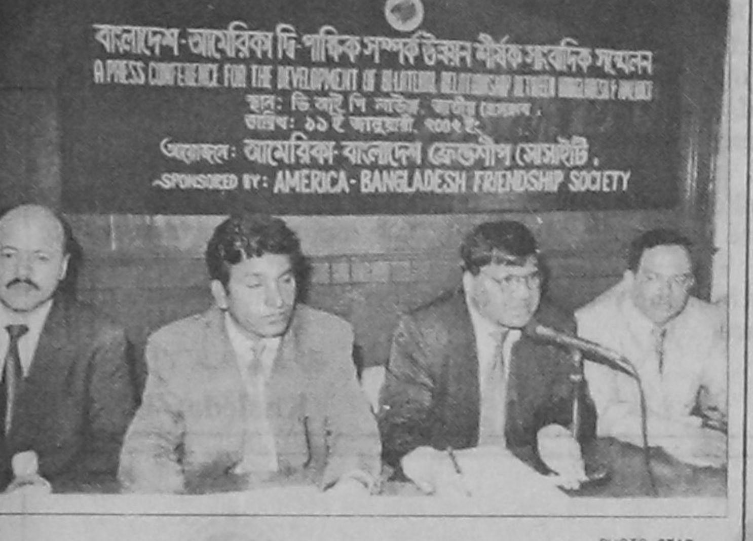
America-Bangladesh Friendship Society held a press conference on the Development of Bilateral Relationship between Bangladesh and America at the National Press Club yesterday.

The demands include withdrawal of the chiefs against acting posts and hand over the charges to senior officers of the concerned office, cancellation of the removal order on employees, implementation of the rules of the promotion to the Deputy Officer and fulfilling the demands of the fourth class employees.